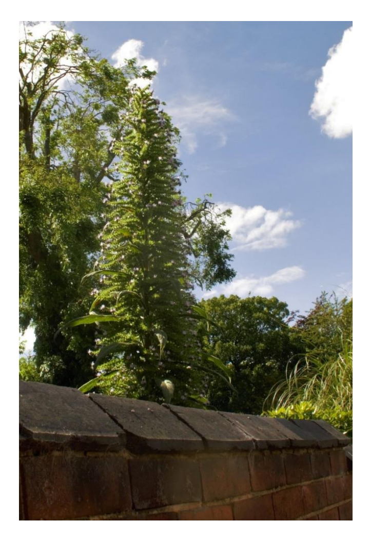
Echium pininana