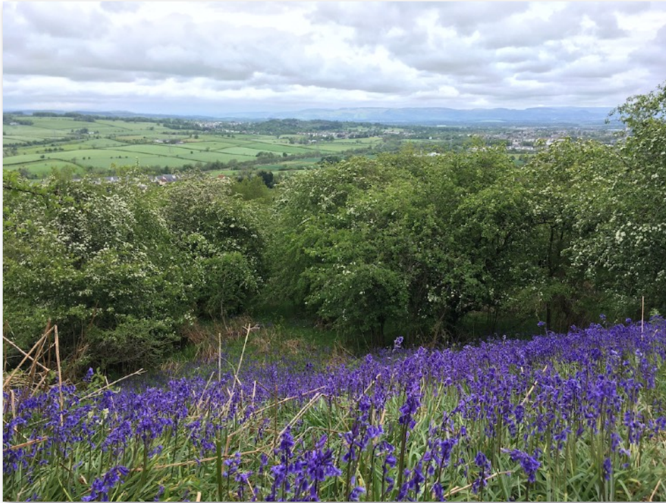
Renfrewshire landscape near Howwood

2022 has again seen lots of plant-recording activity in Renfrewshire. We've run 14 outings and several people have contributed records on their own. As a result the total number of records sent to the BSBI database for the year is likely to be in excess of 8,000.