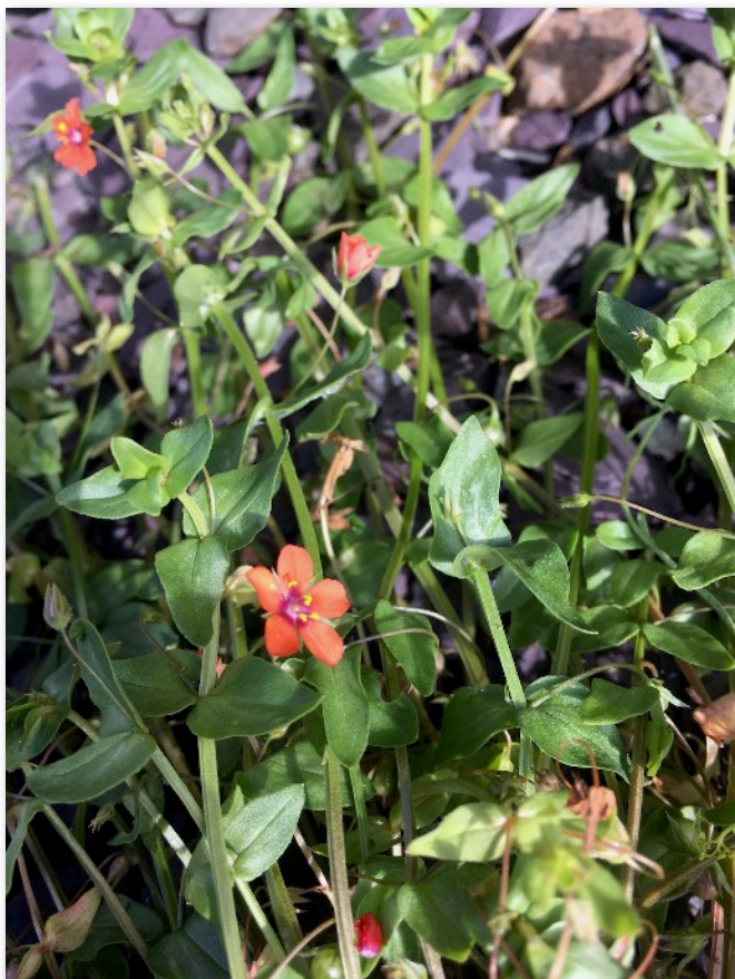
Upper left: Lysimachia tenella (Scarlet Pimpernel)