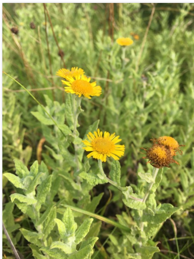
Upper right: Pulicaria dysenterica (Common Fleabane)