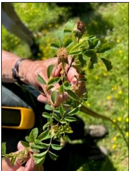
Demonstrating rose identification.

The damp shady track by a pond had Carex remota (Remote Sedge) and both the blue and yellow flowered varieties of Iris foetidissima (Stinking Iris). Rosa canina group Lutetianae (i.e. true Rosa canina ) and Rosa x subcanina were recorded along the lane and elsewhere Rosa canina group Pubescentes (now Rosa corymbifera , Hairy Dog-rose) and Rosa tomentosa (Harsh Downy-rose). During the recce for this meeting, the track was followed across the railway and a nearby pond in the corner of field was visited where Hottonia palustris (Water-violet) was found growing in shady conditions below Typha angustifolia (Lesser Bulrush). Hottonia is now reinstated for the area, having been formerly present at Manor Farm and until recently at Marden Meadow.