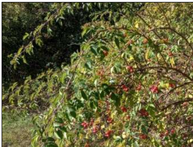
Rosa x subcanina.

and Rosa vosagiaca which we once included in our records as R x dumalis and now we should record as either this or Rosa x subcanina . These bushes, which were Rosa x subcanina , had glabrous leaves with uniserrate margins, strong red colouring to or the stems and large hips, and no glands on rachis or petiole. Rosa x dumalis has leaves whose margins have a tendency to be doubly-serrate and there are glands on petiole and rachis.