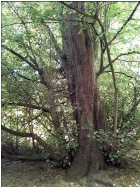
Mature tree.