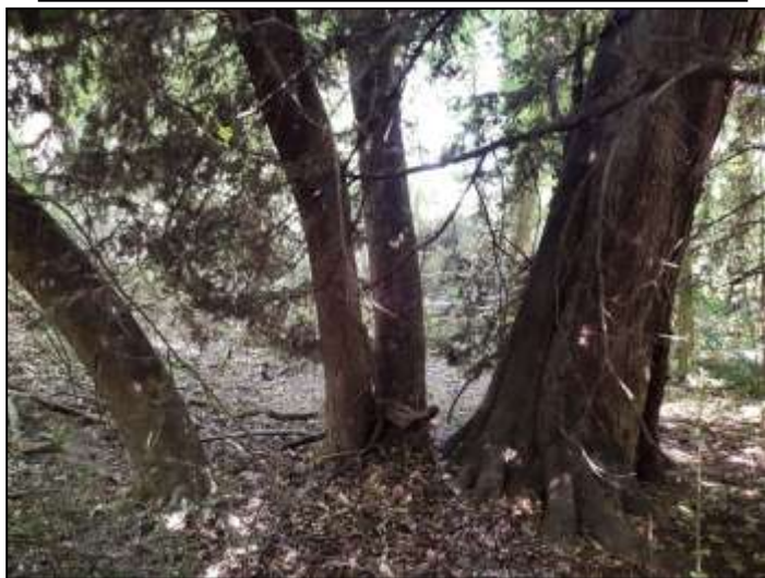
Ancient coppice stool.