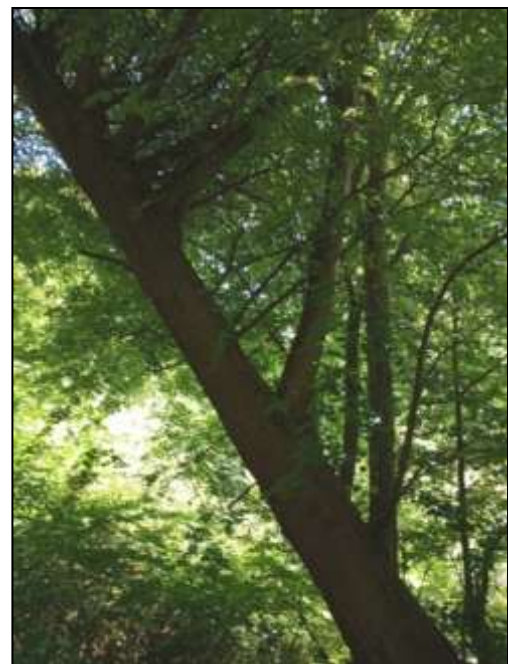
Leaning tree with vertical shoots.