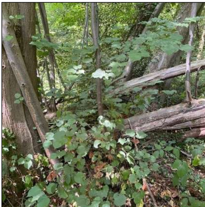
Wind-thrown trunks.