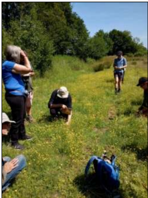
Ranunculus sarduous and flammula .

At the badly drained far end of this pasture were several large clumps of Carex vulpina (True Fox-sedge), growing in Salix scrub in lush vegetation with Oenanthe crocata (Hemlock Water-dropwort).