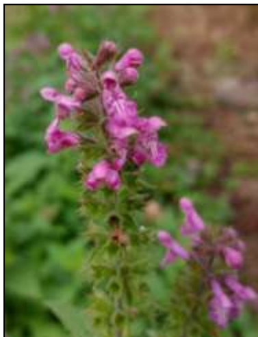
Stachys x ambigua . Photo by Geoffrey Kitchener

A footpath into arable led us into a mass of vigorous weeds – Chenopodium album (Fat-hen), Chenopodium ficifolium (Fig-leaved Goosefoot) and disconcertingly massive Atriplex patula (Common Orache) and Atriplex prostrata (Spear-leaved Orache), which seemed to be attempting to persuade us that they were something else. The fall of land drainage down the field slopes may have had something to do with this vigour, and rows of hop-bines, while separated by herbicidal treatment, were themselves covered in a dense mass of Carex hirta (Hairy Sedge), encouraged by what must usually be dampness, although we were in a period of prolonged drought. Between the hop-bines, we also noted Stachys x ambigua (Hybrid Woundwort, the cross between Hedge and Marsh Woundworts), its habitat perhaps covering some ambiguity between those of its parents.