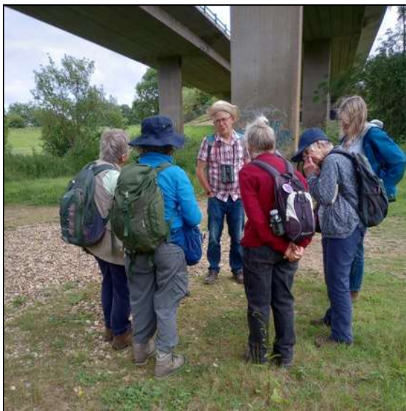
Underneath the arches.

Leaving the Water Meadow area, the group walked past the largest water feature in the park – Haysden Water. A good range of water plants were observed lining the Lake notably Rumex hydrolapathum (Water Dock), Mentha aquatica (Water Mint), Lycopus europaeus (Gypsywort), Phragmites australis (Common Reed), and Bolboschoenus maritimus (Sea Club-rush).