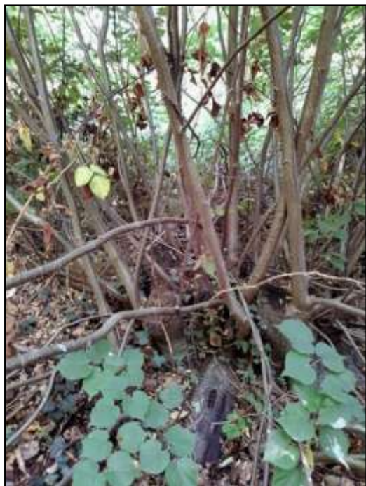
Young coppice growth.