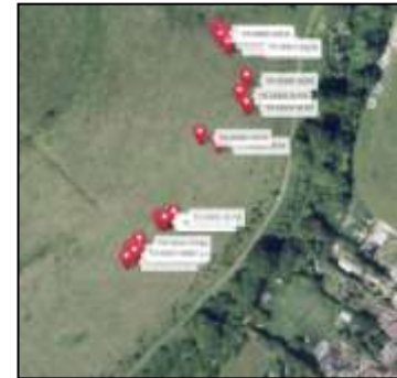
Kentish Milkwort 2021 records for comparison

The apparent spread of records in the main aerial view above needs