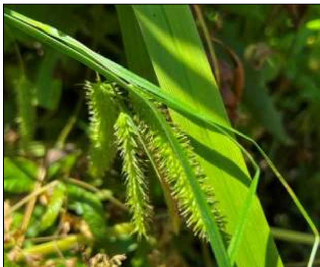
Carex pseudocyperus (Cyperus Sedge).

aquatica (Fine-leaved Water-dropwort), Bidens tripartita (Trifid Bur-marigold), Cardamine amara (Large Bitter-cress) and Eupatorium cannabinum (Hemp-agrimony) all noted. A colony of the rare Carex elongata (Elongated Sedge) previously discovered here was partly hidden in the growing vegetation. Elsewhere in this woodland where a more typical ancient woodland flora was present, there was the hybrid sedge Carex x pseudoaxillaris , along with one of parents, Carex remota (Remote Sedge). Also, a small patch of Carex vesicaria (Bladder-sedge) strongly representative of wet woodlands in the Weald, was seen producing its inflated utricles along the open edge of the wood. In addition to all these sedges, Carex pseudocyperus (Cyperus Sedge) was found growing at a pond by our start (and finish) location.