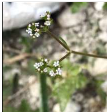
Valerianella dentata .

We were parked on a grass in the corner of an arable field, where some unmown patches held Filago germanica (Common Cudweed) and Bromus secalinus (Rye Brome), the latter also providing interest later in the day when it was found growing alongside the very similar Bromus racemosus (Smooth Brome). In the same spot, a single specimen of an unusual Orobanche , a short plant, with a small number of large, yellowish flowers, proved more difficult, but flowers were taken by Sue Buckingham and Ian Denholm for later examination. As a result, it was determined as an atypical Orobanche crenata (Bean Broomrape), though in this case there were no beans or other members of the Fabaceae to be seen and it might possibly have been using Helminthotheca echioides (Bristly Oxtongue) as its host.