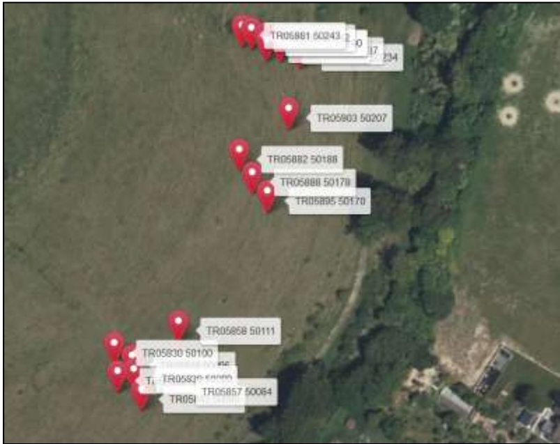
Kentish Milkwort 2022 records