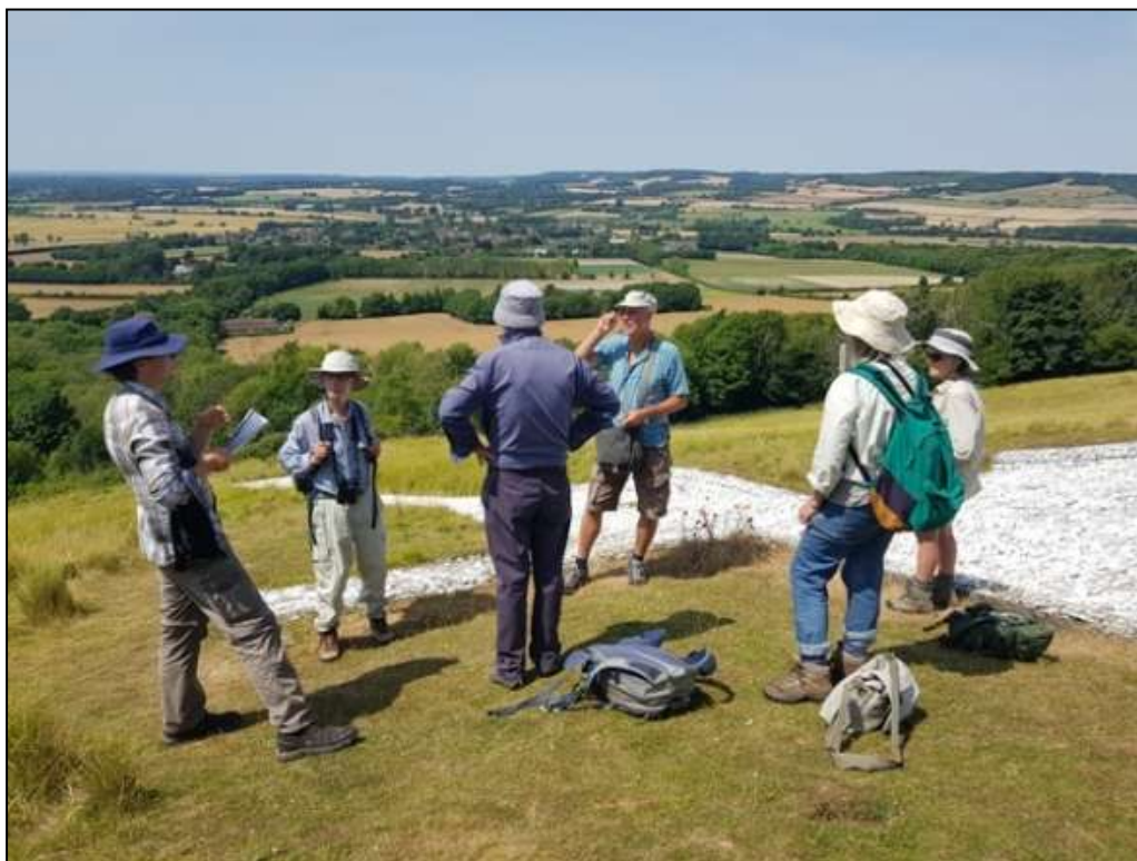
At Wye Crown.

So, we were a small group of seven who met up in the NNR reserve car park, well prepared with sunhats, suntan lotion and ample supplies of water to drink. We agreed that it wasn’t a day for strenuous exercise and best to