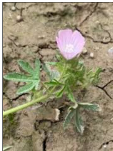
Malva setigera (Rough Marsh-mallow).

The day ended with the much-welcomed tea and biscuits and the satisfaction of locating several new plants, including roses and a few hybrids thanks to Geoffrey Kitchener's knowledge of Rosa canina species 'splits' and dock hybrids!