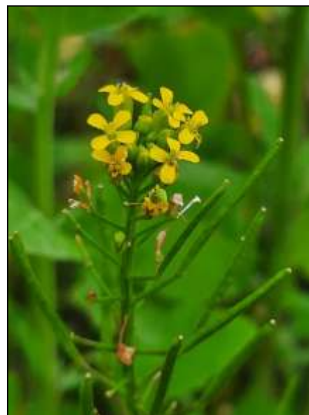
Erysimum cheiranthoides .

decaying remains of Orchis mascula (Early-purple Orchid). The Sussex part of our circuit included a range of terrain with plenty of arable margins, but the Kentish focus of this report brings us to the re-crossing of the Kent Ditch and the discovery by Daphne Mills of five plants of rare plant register species Erysimum cheiranthoides (Treacle-mustard) in an arable field corner. This species has been in considerable decline, both nationally and in Kent, so this was a very welcome find. A range of other arable weeds was recorded in the vicinity and Rumex x sagorskii (the cross between Broad-leaved and Clustered Docks) was noted on a nearby grassy field margin.