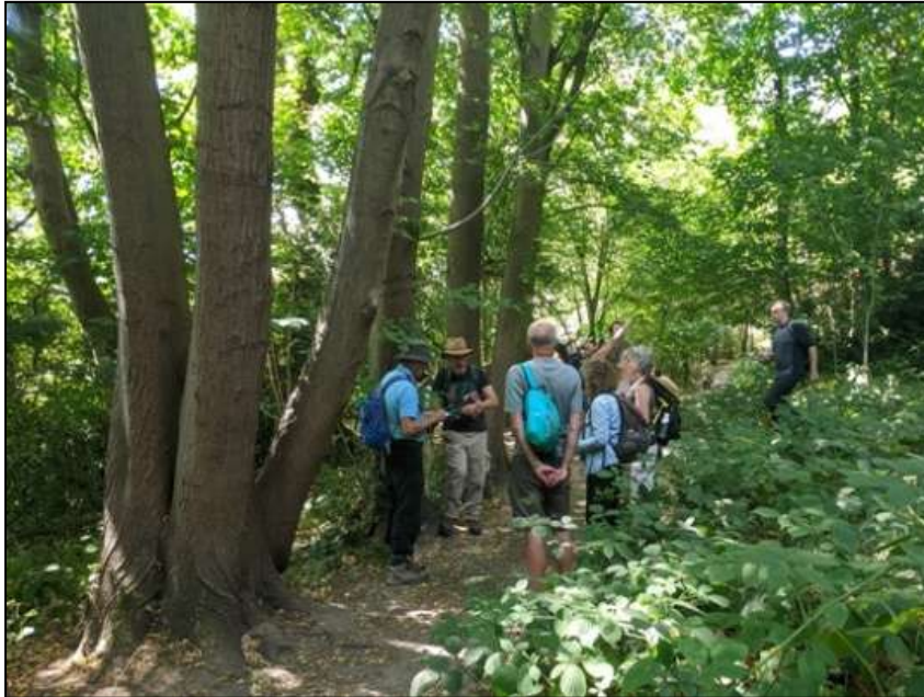
Recording limes.

maps, the ancient Kent/Surrey boundary lay, and it was possible to see that, although the woodland of Threehalfpenny Wood (in Surrey) and Spring Park (in Kent) was continuous, a series of old Tilia cordata trees marked that boundary. We spent some time mapping each tree location, with lunch taken by a huge tree partly wind-thrown and tilting at an angle with vertical shoots arising. Tilia cordata trees were present as ancient trees in both woods as well as the boundary, many multi-stemmed from massive stools deriving from previous coppicing, some formerly pollarded; there were recently coppiced plants and occasional maiden trees. So the limes, although rare in Kent generally, were very well represented and apparently flourishing in this ancient woodland. See p.19 of this newsletter for a further account of these trees.