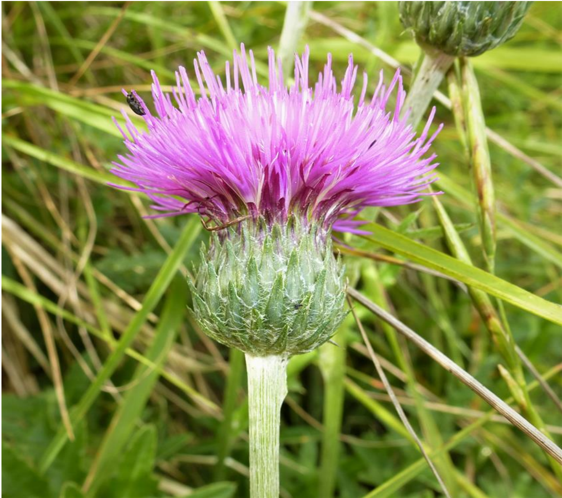
Cirsium tuberosum Tuberous Thistle at Oliver's Castle