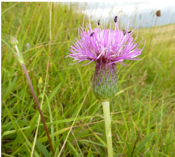
Cirsium x medium