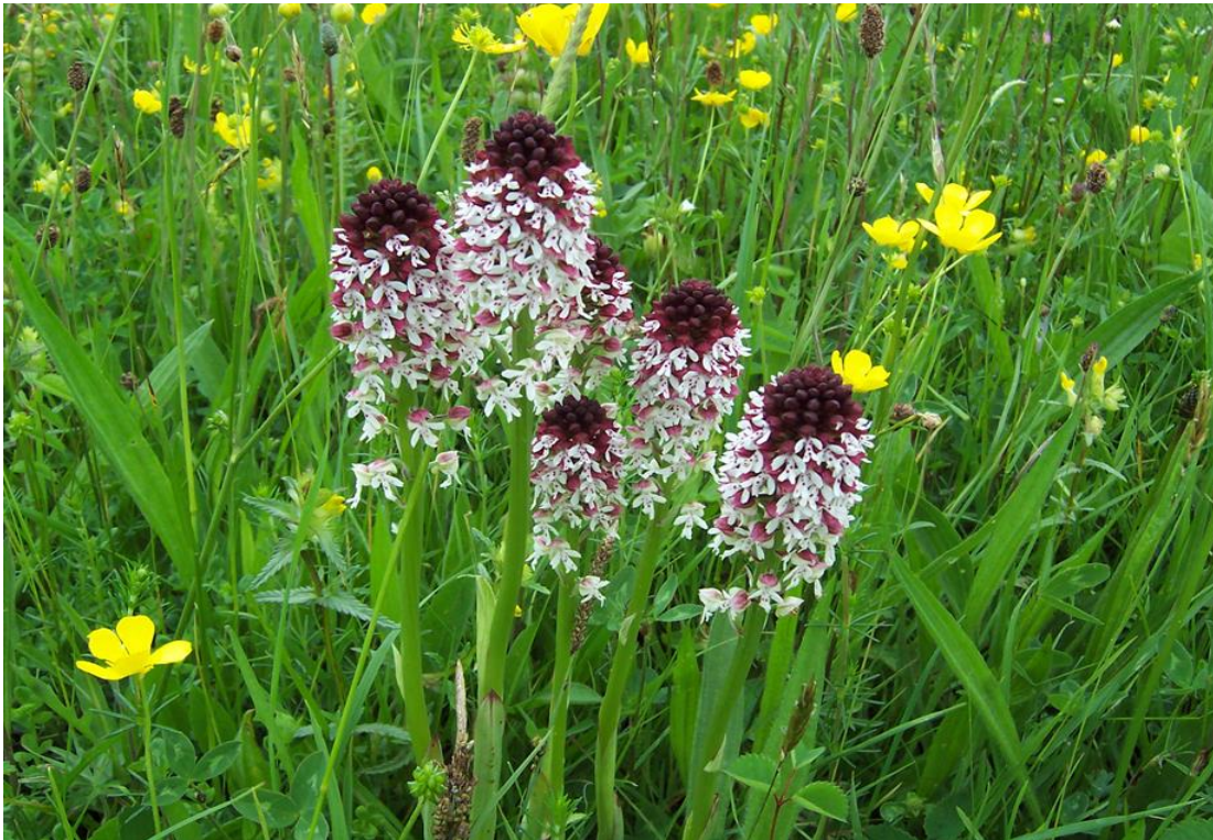
Neotinea ustulata Burnt Orchid at Clattinger Farm