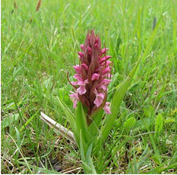
Dactylorhiza incarnata ssp. incarnata