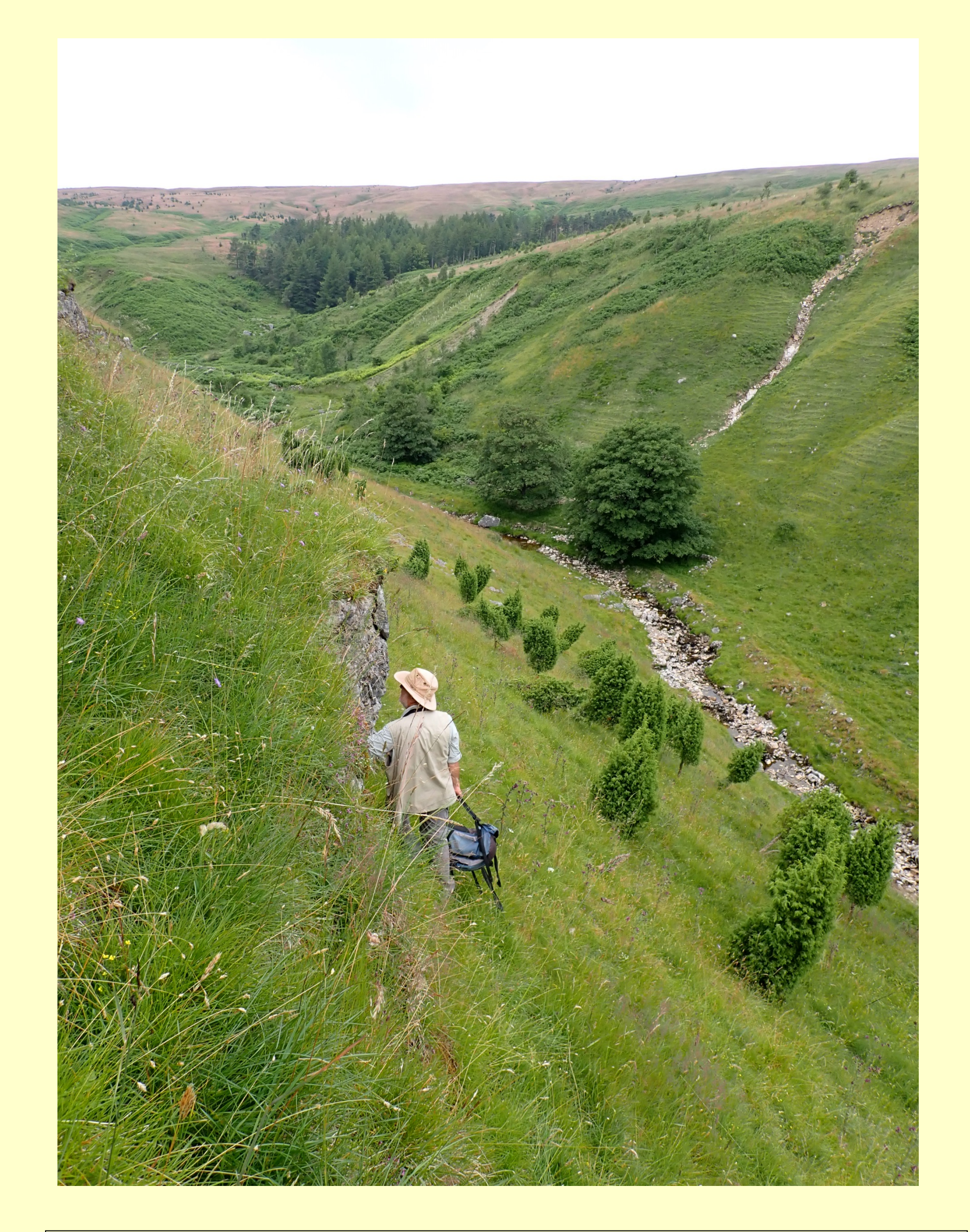
Traversing the steep sided valley of Darnbrook Beck at Malham in 2022

The CfE was formed in 2019 and to date we have produced three issues of English Botanical News. This annual electronic publication is available to all members as a pdf on the web page. We welcome contributions for the next issue, which is due out in 2022 May.