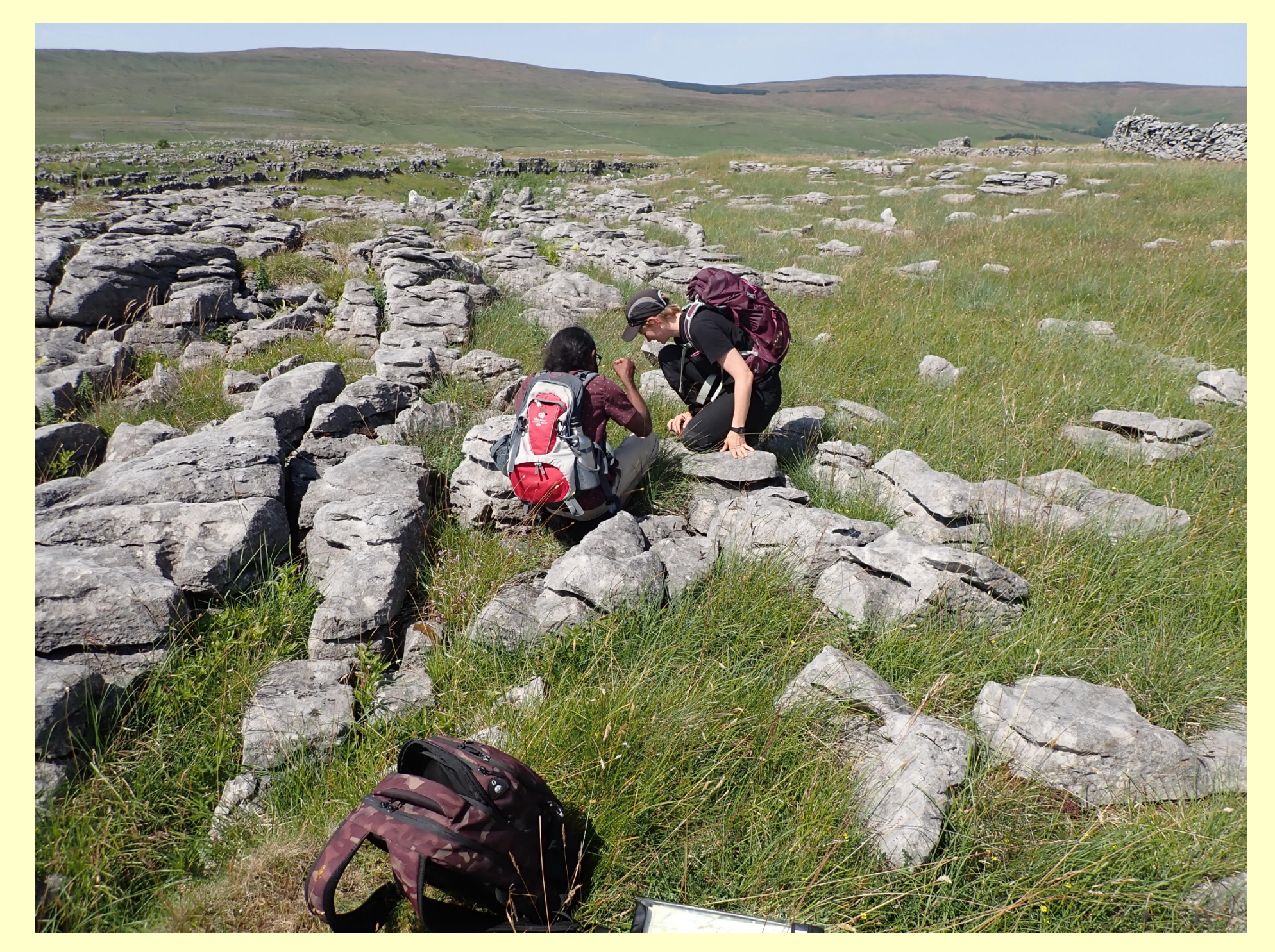
Exploring limestone pavement at Malham Tarn in 2022