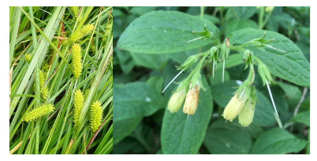
Carex vesicaria (Saddington)