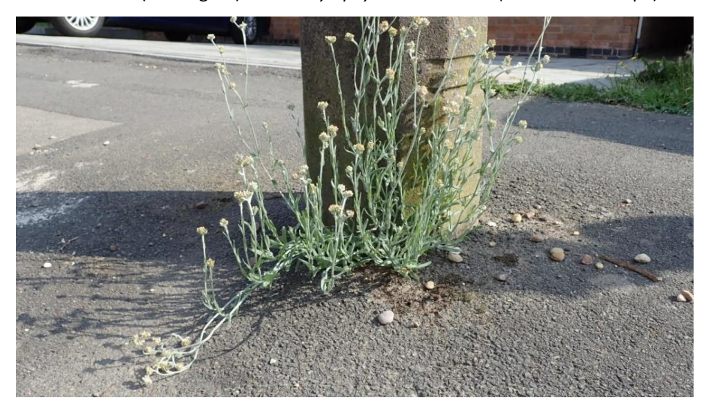
Laphangium luteoalbum (Enderby)