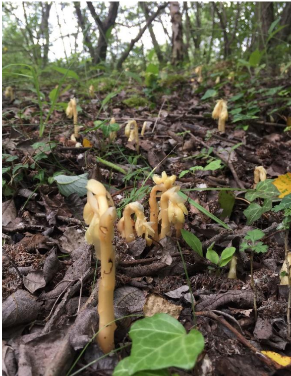
Hypopitys monotropa (Asfordby)