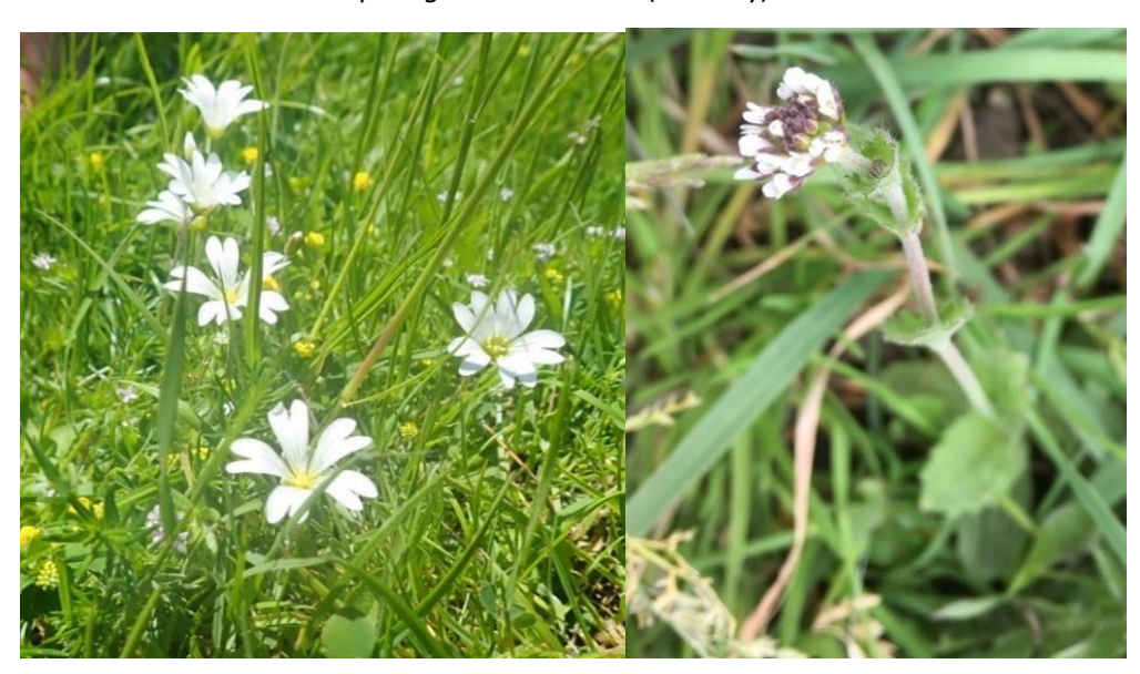
Cerastium arvense (Knipton)