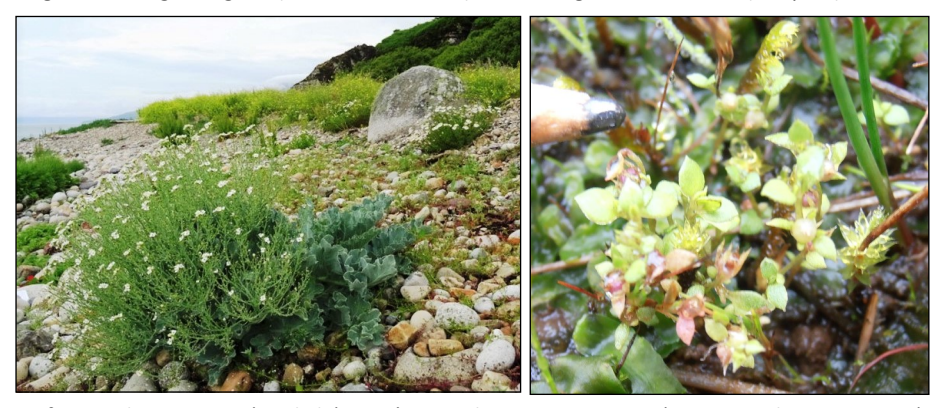
Left: Crambe maritima (sea kale), King's cave shore, Arran vc100. (See p.42; photo S. Cowan) Right: Centunculus minimus (chaffweed), track to Kelly Resr. vc76. First vc record since 1813 (See p. 33; photo A. Hannah: pencil tip for scale)