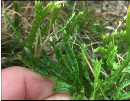
Left: Arabis alpina (alpine rockcress), Skye vc104. Right: Diphasiastrum complanatum x alpinum = D. issleri (Issler's Clubmoss), vc92 (see p.27)