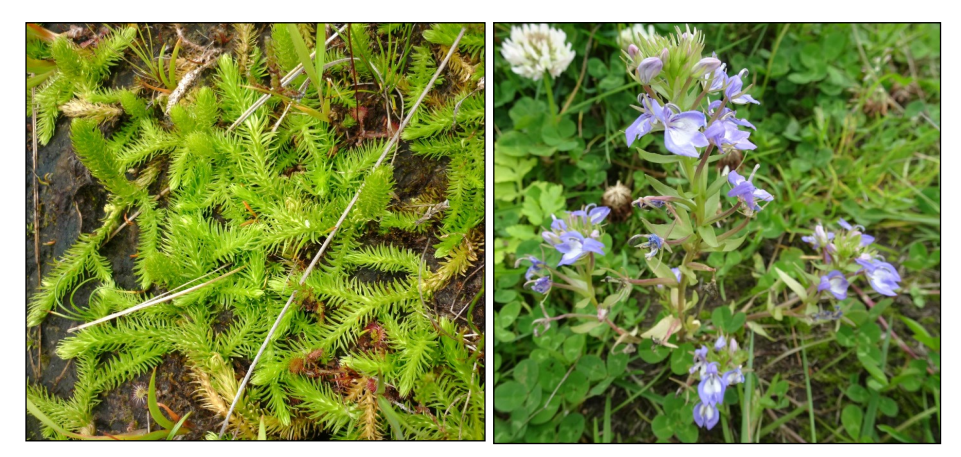
Left: Lycopodiella inundata (marsh clubmoss), Loch Katrine vc87 (see p.23) Right: Downingia elegans (Californian Lobelia) Dufftown golf-course, vc94 (see p.28)