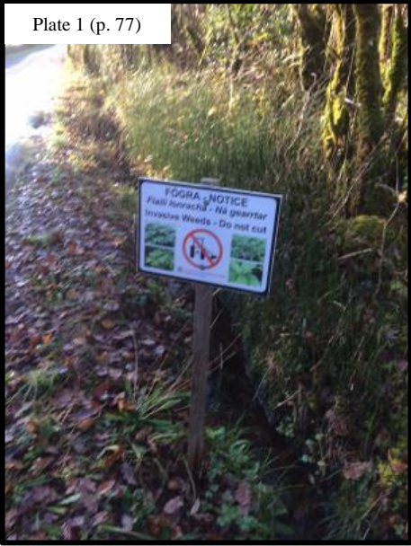
Plate 1 (p. 77)