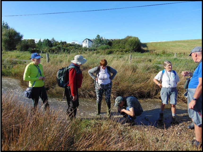
Members looking at Sarcocornia perennis (Perennial Glasswort), Bannow Bay, Co. Wexford (H12). (p. 76)