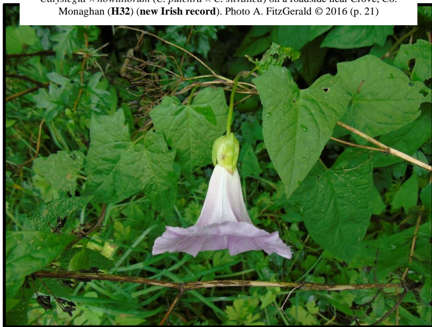
Calystegia × howittiorum ( C. pulchra × C. silvatica ) on a roadside near Crove, Co. Monaghan (H32) (new Irish record). Photo A. FitzGerald © 2016 (p. 21)