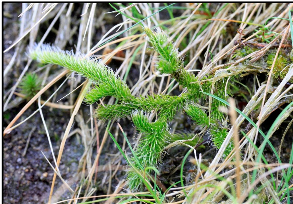
Lycopodium clavatum (Stag's-horn Clubmoss) plant near Clermont Cairn, Co. Louth (H31).  (p. 46)