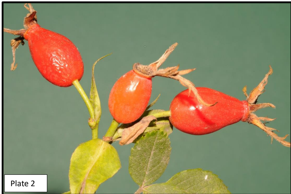
Rosa corymbifera x R. sherardii – pages 36-38. For captions see page 76. (for article see page 6)