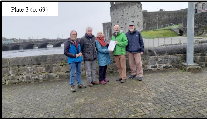
Plate 3 (p. 69)