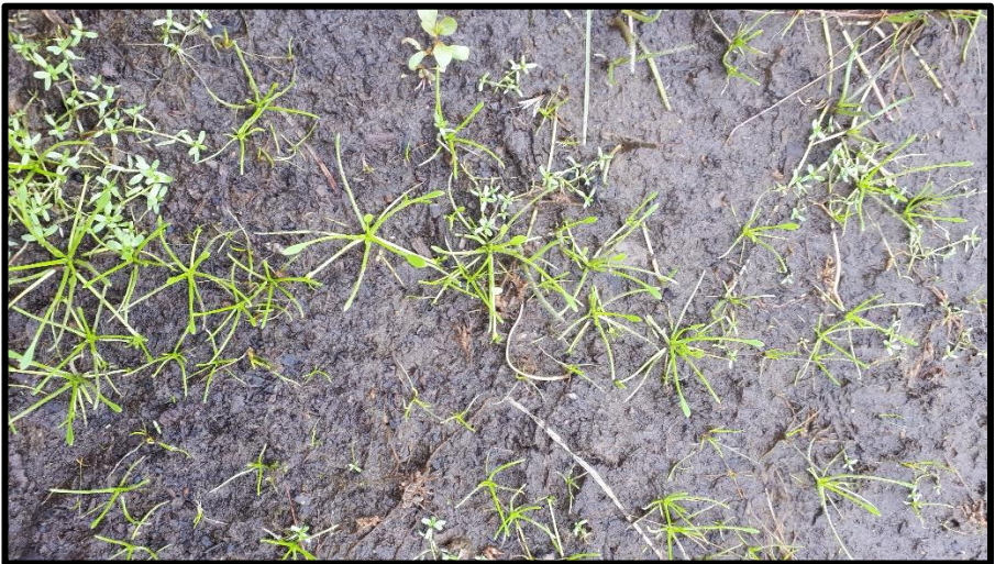
Limosella aquatica (Mudwort) population at Lough Allen, Co. Leitrim (H29). (p. 67)