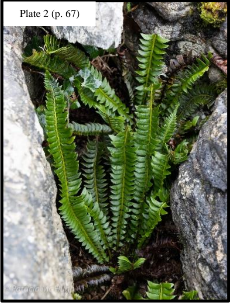
Plate 2 (p. 67)