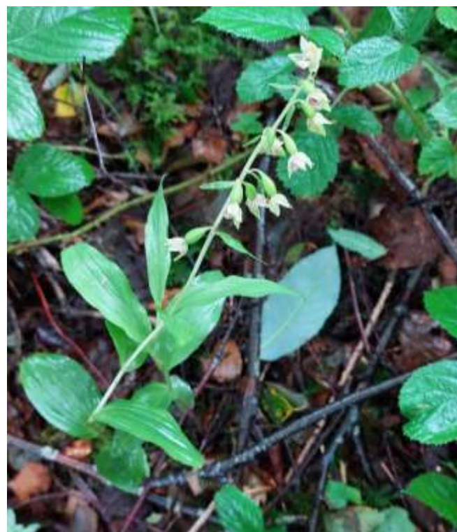
Epipactis dunensis Longdendale D Mallon.