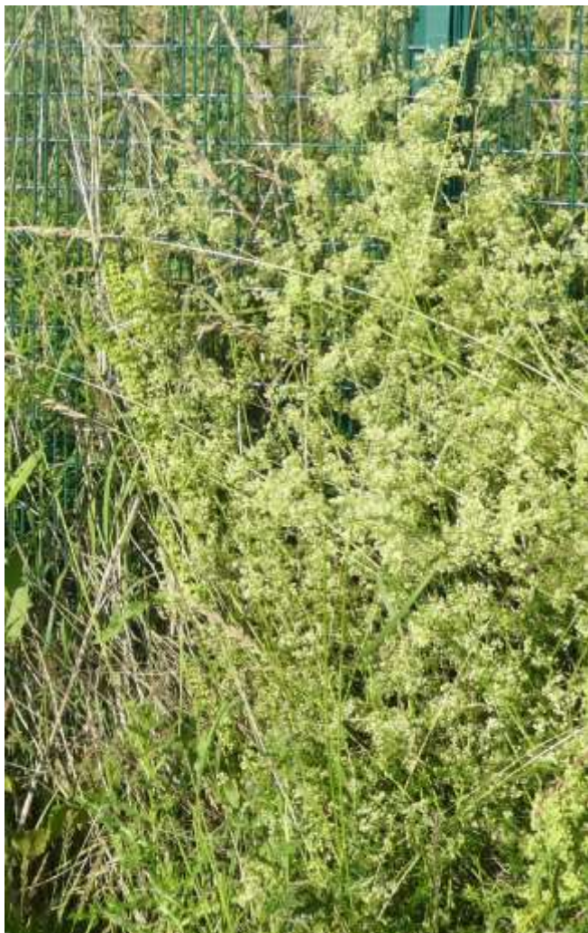
Galium x pomeranicum Cresswell M Lacey.

This hybrid had not been recorded locally since 1969 when Mick Lacey reported it from Highwood Lane near Cresswell (SK5176) in July. It was growing on the roadside with its two parents.