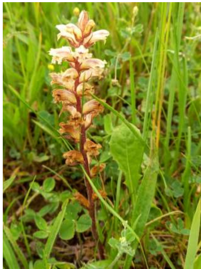
Orobanche minor Poulter

I recorded only the second record for this species in the county on the High Peak Trail near Minninglow (SK1958) in June.