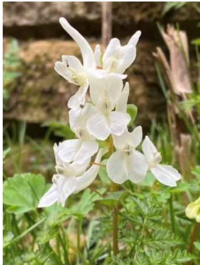
Corydalis cava Whaley Bridge D Blowers.

This is the hybrid of Galium alba (Hedge Bedstraw) with Galium verum (Lady's Bedstraw). Continued over page.