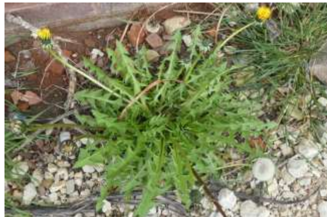
Taraxacum amplum Chesterfield M Lacey.

This introduced species of waste ground and gardens was recorded outside Chesterfield bus station (SK3870) in March by Mick Lacey. It is said to be probably under recorded.