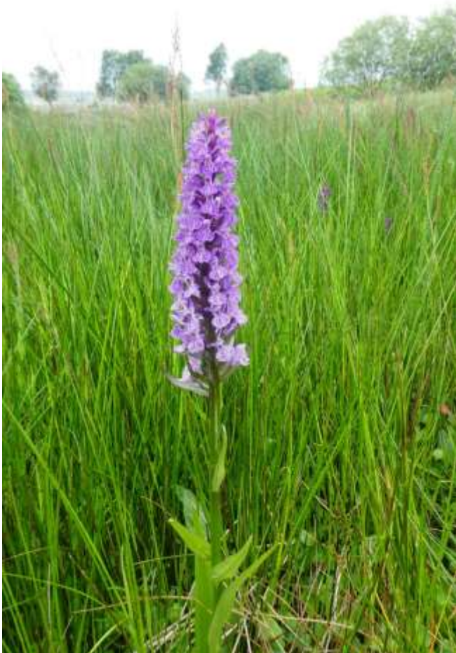
Dactylorhiza x hallii Leash Fen