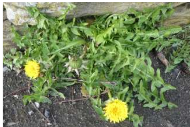
Taraxacum densilobum Newbold M Lacey.

This possibly native species of grasslands and gardens was reported from a pavement at Newbold (SK3773) by Mick Lacey in March.