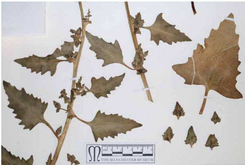
Atriplex x taschereaui hybrid derivative. Note the short triangular leaves and very large, leaf-like, non-spongy bracteoles, elongate spines and pseudostalks. Tongue, Sutherland, Scotland. 2nd September 1975. Taschereau MANCH collection, 1978.

In the first article of this series, to be published in the Journal of British and Irish Botany , I have dealt with the descriptive terminology used in the identification of the annual native Atriplex (oraches), and described findings from a ten-year study based on Norfolk plants and an analysis of the Taschereau MANCH collection of Atriplex longipes and its hybrids. Here, I present a key derived from these findings, together with illustrations.