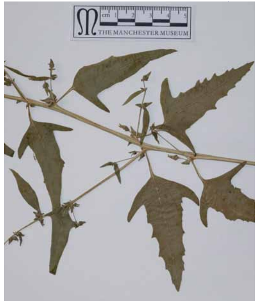
Atriplex x gustafssoniana hybrid derivative close to A. longipes s.s. Note the elongate triangular-trullate leaves with exaggeratedly long basal lobes. Looe, Cornwall, 1978?. Taschereau MANCH collection, 1978.

With the exception of those for Atriplex praecox , which are redrawn from Taschereau (1985), the drawings are all of Norfolk specimens or selected from the Taschereau MANCH collection of A. longipes and its hybrids. For anybody with a