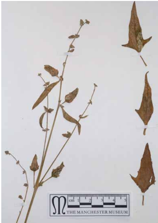
Atriplex longipes s.s. Note the elongate trullate leaves and non-spiny, entire edged bracteoles, with very long stalks. Penpoll, Cornwall. Taschereau MANCH collection, 1978.

or A. x taschereaui – in other words, there were no characters that occurred only in the one taxon and occurred in all examples of that taxon. There were, however, a good number of partially diagnostic characters that did not occur in all examples but which could be used to define a taxon if used in diagnostic character combinations . Partially diagnostic characters can be of two types: first, those that, when they do occur , are truly diagnostic as they never occur in other taxa; and secondly, characters that are particularly frequent in the taxon concerned, or occur to an extreme degree, but are very infrequent or little developed in other taxa.