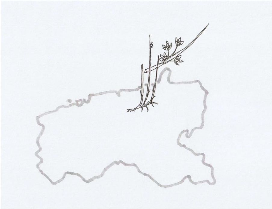
Schoenoplectus triqueter (Triangular Club-rush)