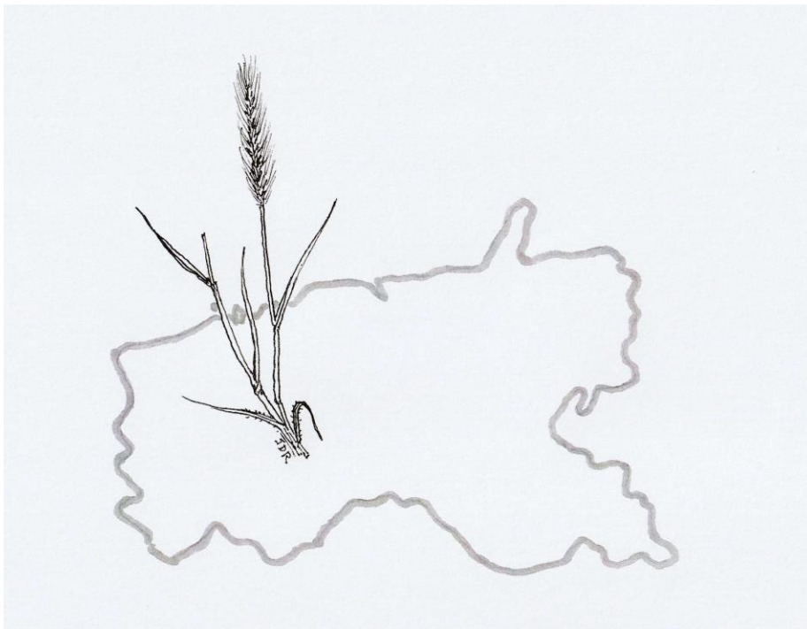
Hordeum secalinum (Meadow Barley)

On title page: Trifolium fragiferum (Strawberry Clover)