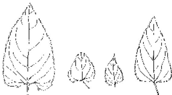
S. nodosa L.: Leaves ovate to triangular, acute at apex, rounded to cordate at base, sharply toothed (serrate), glabrous, petiole unwinged though lamina often asymmetrically decurrent.