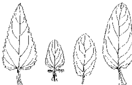
S. auriculata L.: Leaves elliptical to ovate, apex obtuse to acute, deeply cordate to rounded at base, bluntly toothed (crenate), sometimes nearly serrate (especially on upper leaves), usually glabrous (rarely sparsely or minutely hairy), petiole often winged with 0-2 lobes.