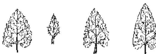
S. scorodonia L.: Leaves rugose, ovate, acute to obtuse at apex, cordate at base, doubly serrate, pubescent, petiole unwinged or very narrowly winged, hairy.