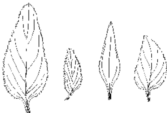
S. umbrosa Dumort.: Leaves elliptical to ovate (to lanceolate), acute to obtuse at apex, truncate to cuneate at base, with sharp teeth (serrate), glabrous, petiole obviously winged, without basal lobes.

Vegetatively, the four native species can be distinguished from the lower stem leaf shape and tothing. Upper stem leaves are often narrower. Do not confuse developing shoots in leaf axils with lobes in the petioles of S. auriculata . S. umbrosa , which may be significantly under-recorded, may be spreading ( Scarce Plants ), and may be confused with S. auriculata . Plants with the leaves of S. umbrosa but with entire staminodes (cf. Stace's New Flora ) should be collected for further investigation.