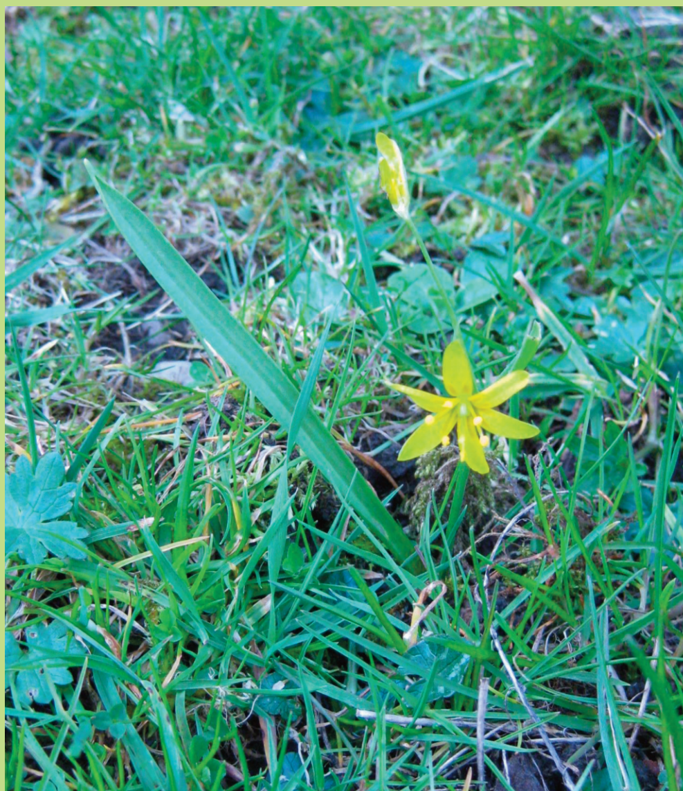
Gagea lutea Yellow Star-of-Bethlehem Seren-Fethlehem felen