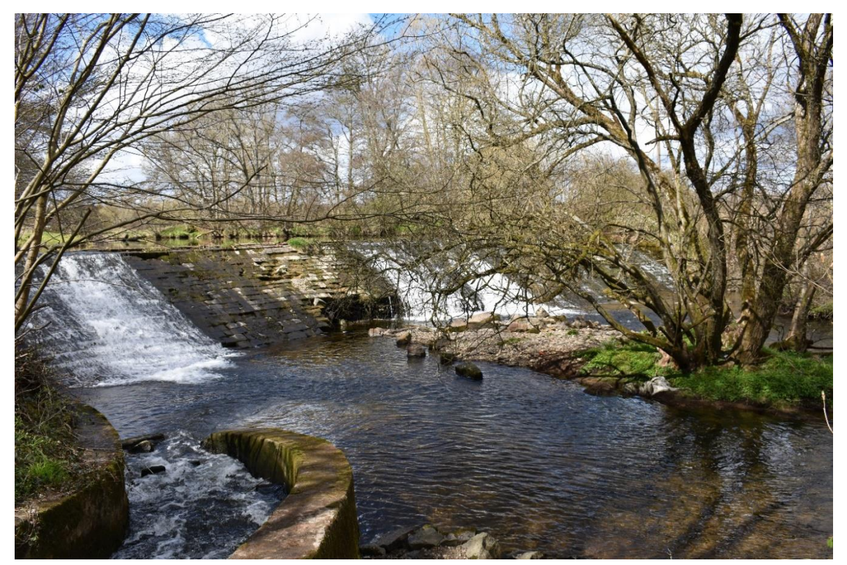
The Shochie Burn weir