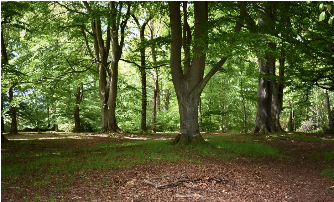
Photo 1 Beech woodland at Broomhill