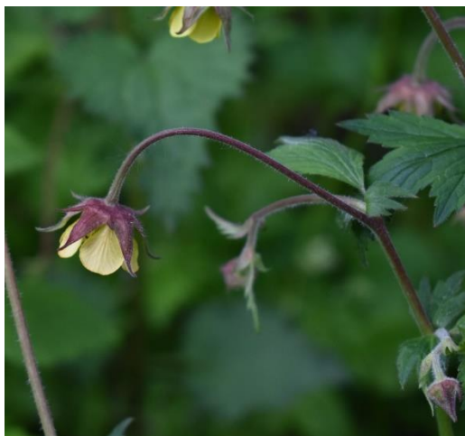
Photo 6 Geum x intermedium : hybrid of G. rivale (Water Avens) x G. urbanum (Wood Avens) in the Den of Methven