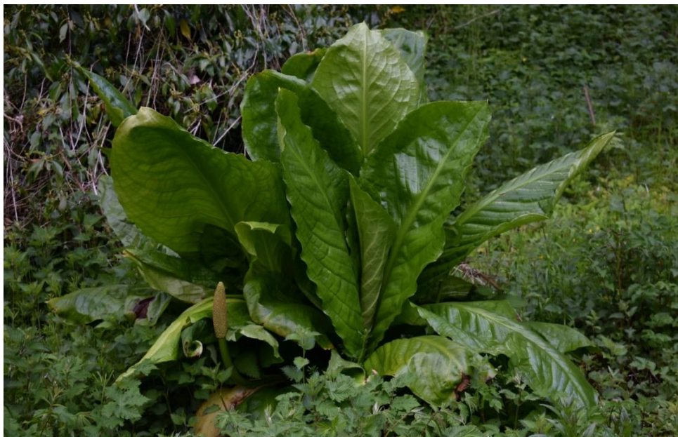
Photo 7 Warning! Warning!! Neophyte!!! Approaching!!!! Lysichiton americanus (American Skunk-cabbage) in the Den of Methven