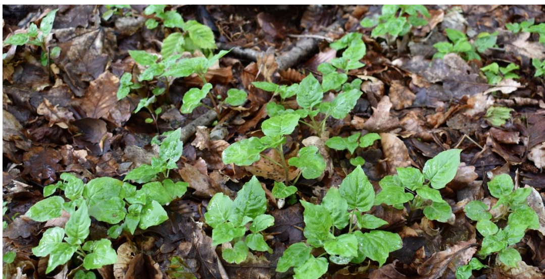
Photo 4 Enchanter's-nightshade defying deep woodland shade at Broomhill