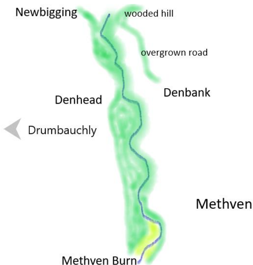
Map 2. Den of Methven woodland study area (not to scale)

The Den of Methven may be best known for its association with the battle that took place in 1306 between the forces of Robert the Bruce and the Earl of Pembroke, sent by Edward I. There are different versions of the event, including the actual site of the battle at Methven. Therefore, we shall move on to the reason for our visit, only to comment that Bruce and his forces were defeated.