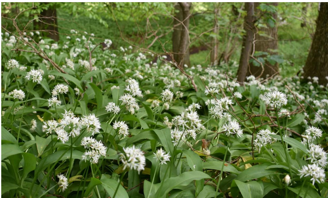
Photo 2 Spring display of Ramsons at Broomhill