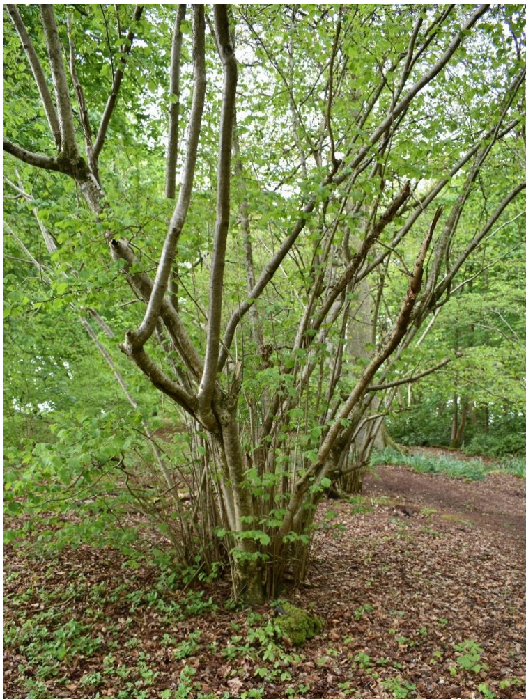
Photo 3 Hazel coppice at Broomhill