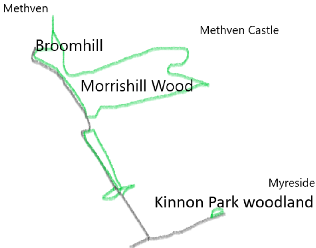
Map 1. Woodland study areas outlined in green (not to scale)

The first map of Scotland to provide any impression of scale and detail was produced by Major-General William Roy. Roy's Military Survey of Scotland, 1747-1755 , indicates no woodland in what is now the Broomhill to Kinnon Park area. The nearest woodland is Methven Wood adjacent to the banks of the River Almond and the policy woodland of Methven Castle. Some 3.5km to the north, natural woodland is shown on both sides of the River Almond and the estate policy woodland of 'Logie Almond' on the north bank.