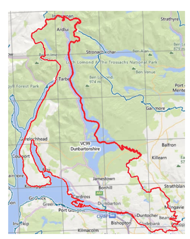
Map of Dunbartonshire (vc99)

There are some real attractions which even beautiful Lanarkshire cannot boast . . . high mountains . . . lots of coastline . . . and the shore and islands of a major loch.