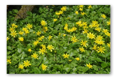
Ficaria verna (Lesser Celandine)

As you read on, you'll note that there have been some changes of roles and responsibilities.