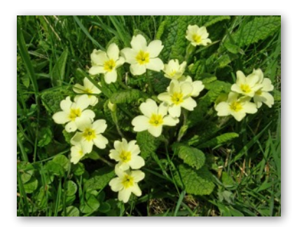
Primula vulgaris (Primrose)