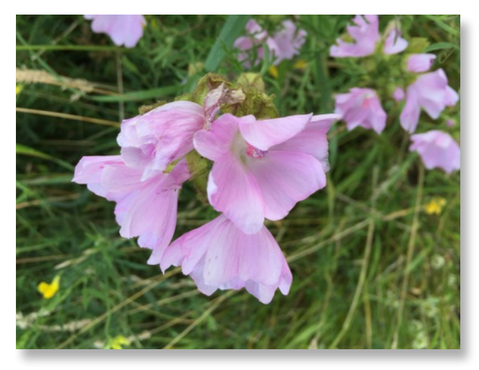
Malva moschata (Musk Mallow) (The opening image of this new photographic website)

We now have over 3,500 photographs of 850 species and we are always looking for more photographs, species and photographers.