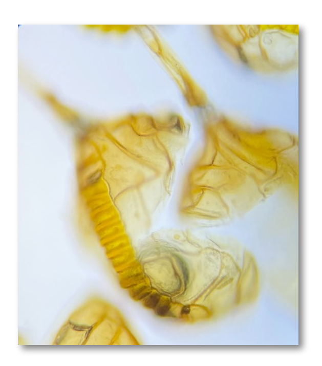
Polypodium sori have distinctive patterns when seen under the microscope

Peter Wiggins, 26 Braidpark Drive, Glasgow G46 6NB