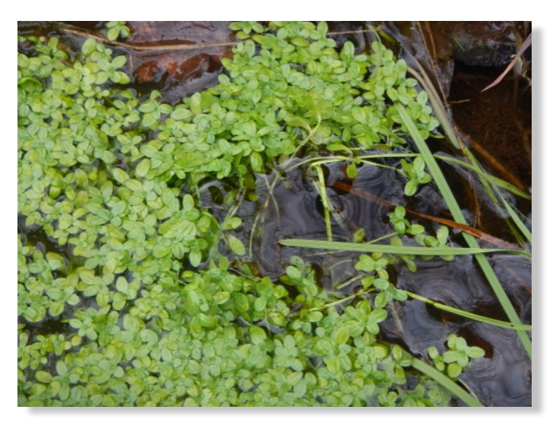
This mass of aquatic vegetation is simply a colony of lots of individual Callitriche plants. Specimens can readily be hooked out using a walking pole, placed in a plastic bag or tub - and sent in!