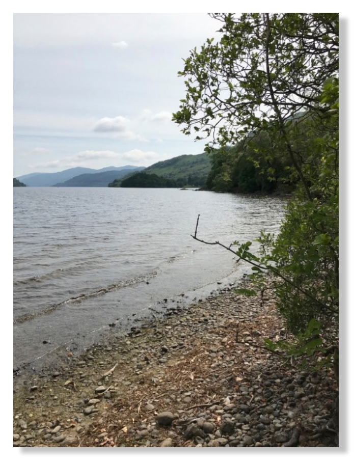
View southwards, down the western shore of Loch Lomond, from Rubha Ban