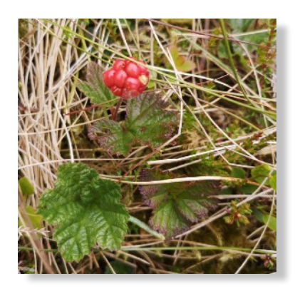
Rubus chamaemorus (Cloudberry)