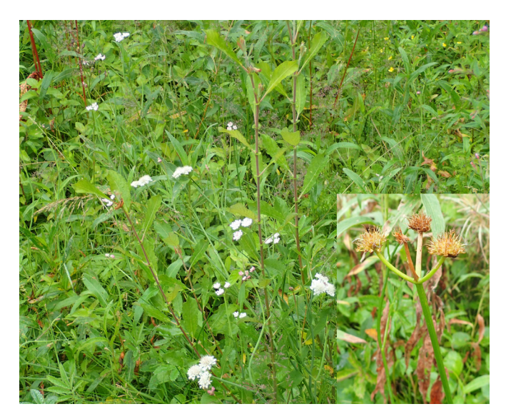
Fig. 2. Oenanthe fistulosa , Tubular Water-dropwort, inset fruits, photo by Mags Cousins, 2017.

Pool 5 was the reappearance of Oenanthe fistulosa , Tubular Water-dropwort (Fig. 2) after an absence of nine years, when in 2007, there was plenty of it. There were half a dozen flowering plants in 2016, the summer following clearance, which rose to over 30 plants in 2017 and back to half a dozen plants in 2018. The digger and forwarder used to fell trees in this contract churned up the ground a fair bit as conditions became increasing wet into winter 2015/16, but perhaps this was just what was required to expose the buried seed.