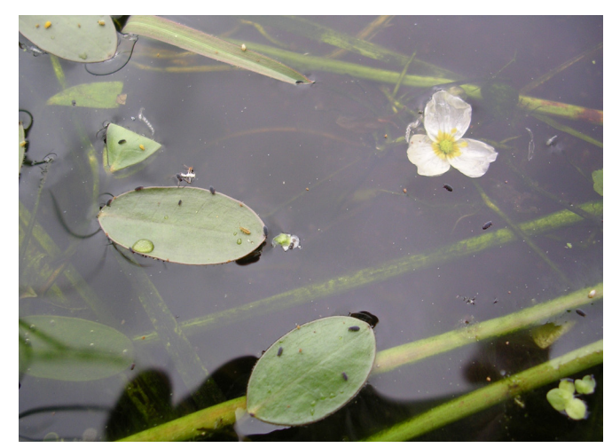
Fig. 3. Luroniun natans Floating Water-plantain at Pool 6, photo taken 2006.