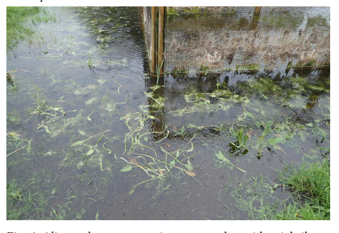
Fig. 6. Alisma plantago-aquatica uprooted outside trial silt scraping plot, photo by Mags Cousins, 2018

Another major concern of silt removal is the potential detriment to the nationally rare liverwort Riccia canaliculata , Channelled Crystalwort as the bare mud of the drawdown zone is its favoured habitat too and Brown Moss is the only remaining site in England. Sharon Pilkington (2016) found R. canaliculata in this locality albeit at low abundance compared to other margins of Pool 6 so it was considered a low risk location for the silt scraping trials. A detailed survey beforehand recorded no R. canaliculata prior to silt scraping in 2017 (Cousins, 2018). I resurveyed the plots three times this year with the help of various sharp eyed botanists including Dan Wrench and Hilary Wallace, and on each successive occasion