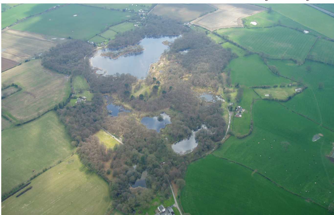
Fig 1 Aerial view 2004 before the most recent tree clearance around pool margins, photo from Shropshire Council.

So the question is, has anything made any difference yet? An encouraging early response presumably to disturbance and increased light, on the edge of