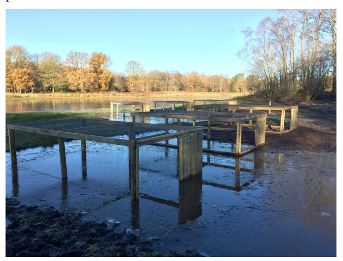
Fig. 4. Trial silt scraping plots at Pool 6, photo by Mick Smith, Wildbanks Conservation, 2017