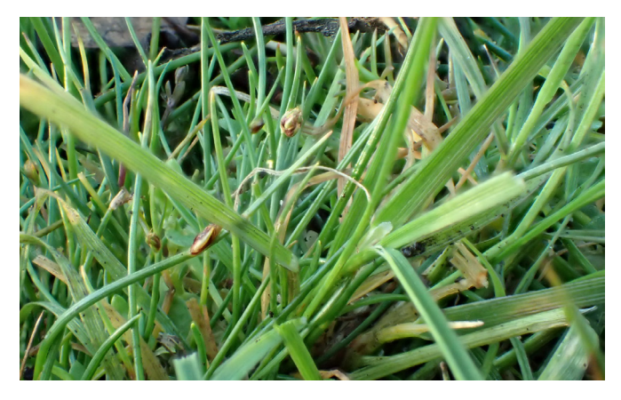
Fig. 5. Isolepis setacea , Bristle Club-rush at Pool 6, photo by Mags Cousins, 2017

living tissue. Reliably securing the population at Brown Moss is a major priority as the decline of this Annex II species across Europe is the main reason for the designation of the site as a Special Area of Conservation.