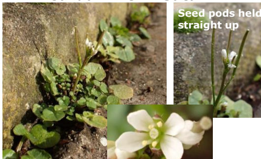
Seed pods held straight up