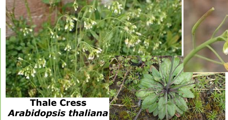
Thale Cress Arabidopsis thaliana

Hairy and Wavy Bittercress are sometimes quite difficult to tell apart as they are both very similar looking. Both grow from a basal rosette of pinnate (composed of opposite pairs of leaflets) leaves and have erect, often branched, flowering stems. Both have long narrow seed pods. But there are several differences which can help you to tell them apart. Habitat is a good indicator. Hairy is generally found in drier habitats than Wavy, such as open cultivated ground and gardens, walls and pavement cracks. Wavy prefers damper, shady places including woodland stream banks, marshes and gardens. Next, the leaves. The basal rosette of leaves in Hairy is quite compact, whereas Wavy has a looser rosette. Wavy is generally a bigger and more leafy plant than Hairy, with 4-10 stem leaves compared to 1-4 in Hairy. Each leaf also has more leaflets - Wavy has 5-15, compared to 3-11 in Hairy. Next, the seed pods. In Hairy they are held straight upright and overtop the flowers and buds. In Wavy they are held out at an angle from the stem and barely overtop the flowers. A key difference is the number of stamens, and you might need to get your hand lens out to see this. Hairy generally has 4 stamens and Wavy generally has 6 (beware as two of them can be a bit shorter). The stems of Wavy can be, as the name suggests, slightly zig-zag, but you shouldn't base your ID on this alone. Hairy has hairless stems, but hairy leaf stalks, and Wavy usually has hairy stems.