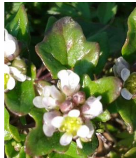
Danish Scurvygrass Cochlearia danica

This plant has a most unhelpful common name, as it is not a grass and has no particular association with Denmark! It starts flowering around March and is a low-growing, mat forming plant with lilac-white flowers. The leaves are dark green - the basal ones are long-stalked, shallowly lobed and have a heart shaped base. The stem leaves are ivy-shaped, and the upper ones are unstaked. The seed pods (not pictured) are egg-shaped. Traditionally a coastal plant, its high salt tolerance has enabled it to rapidly colonise the verges of salted roads inland, its seeds being wafted along by the turbulence caused by fast moving traffic. It is rich in vitamin C and was used to provide protection from scurvy, hence the name!