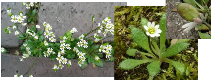
Common Whitlowgrass Erophila verna

This plant has a most unhelpful common name, as it is not a grass and has no particular association with Denmark! It starts flowering around March and is a low-growing, mat forming plant with lilac-white flowers. The leaves are dark green - the basal ones are long-stalked, shallowly lobed and have a heart shaped base. The stem leaves are ivy-shaped, and the upper ones are unstaked. The seed pods (not pictured) are egg-shaped. Traditionally a coastal plant, its high salt tolerance has enabled it to rapidly colonise the verges of salted roads inland, its seeds being wafted along by the turbulence caused by fast moving traffic. It is rich in vitamin C and was used to provide protection from scurvy, hence the name!