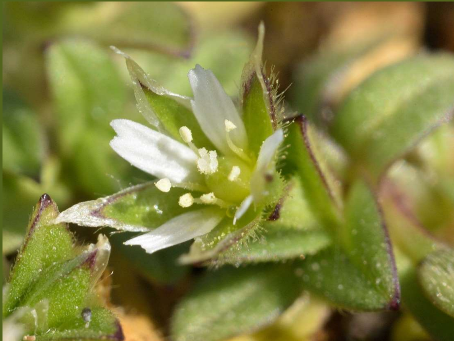
Cerastium semidecandrum , Hay-on-Wye, 2019