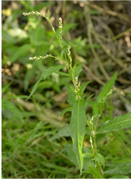
Persicaria mitis , Hay-on-Wye, 2019.