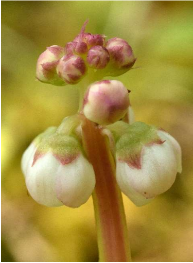
Pyrola minor , Coelbren 2020.