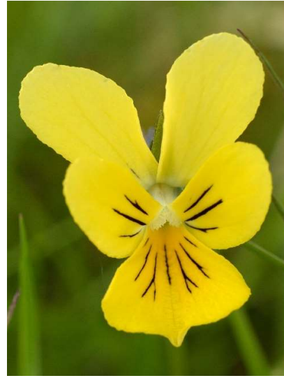
Viola lutea , Epynt, 2016.