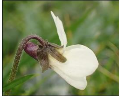
Sweet Violet (top) & Hairy Violet (bottom)

Sepals These two species are the only ones to have rounded, blunt-tipped sepals, all the rest have pointy sepals.