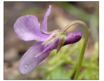
Early Dog (top) & Common Dog (bottom) Violet

Sepals These two species have pointy sepals.