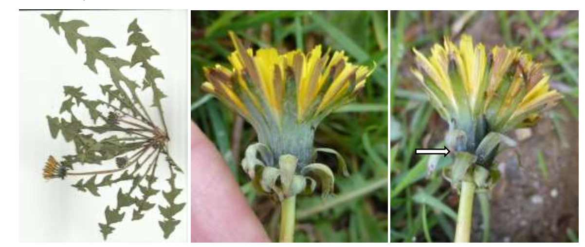
11b. Exterior bracts >3.0 mm in width, spreading to suberect distally; leaves bristly hairy above (13a-13b)

13a. Upper surface of leaves dull grey-green, densely hairy; stigmas orange. Shetland T. hirsutissimum