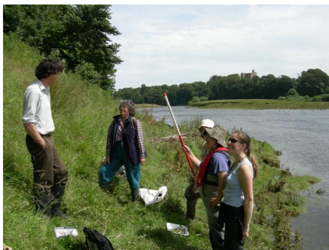
River Tweed opposite Norham Castle

Many monads have never been recorded. Thus Ranunculus repens , the most widely recorded species, has only been recorded from 450 monads (some of the monads on the VC boundary are of less than 1km 2 ), compared with the VC area of 1,202km 2 . The coverage is in some