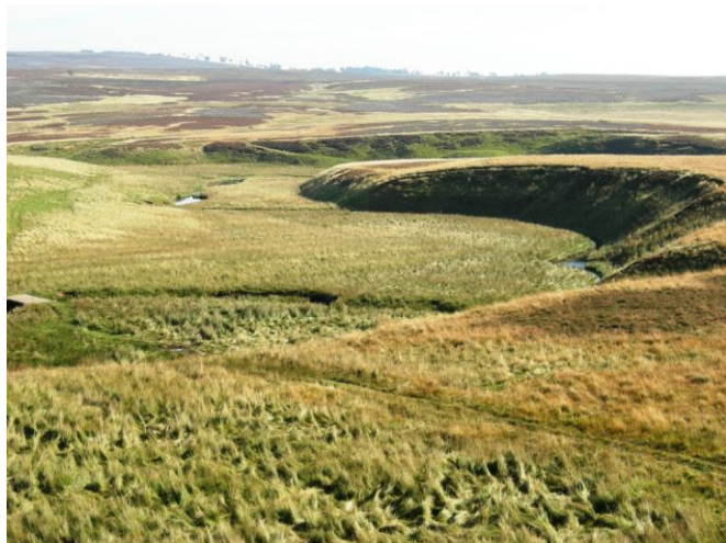
View south to Greenlaw Kaims and Moor

Nevertheless I see the key opportunity to be the repeat recording of the sites in the Botanical Site Register (which is inter alia a Rare Plant Register organised by site rather than species). This will inevitably provide evidence of change (and new discoveries). I see the fact that this information is site-structured as a big plus towards making such a task enjoyable and rewarding. Analysis of the records to date has shown losses of 14% a decade for site-faithful scarce species at monad scale and 11% at hectad scale. The losses have been ongoing fairly evenly over the period 1828-2013. No other VC has prepared such statistics. Berwickshire is unlikely to be unusual in this respect.