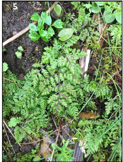
1-5: Mountain plants in Glen Lyon (see p.7) 1 Cornus suecica , 2 Bartsia alpina , 3 Salix myrsinites , 4 Tofieldia pusilla , 5 Cystopteris montana

Left: Lotus dorycnium (formerly D. pentaphyllum ) new to Scotland in wild in vc83 (see p.36)