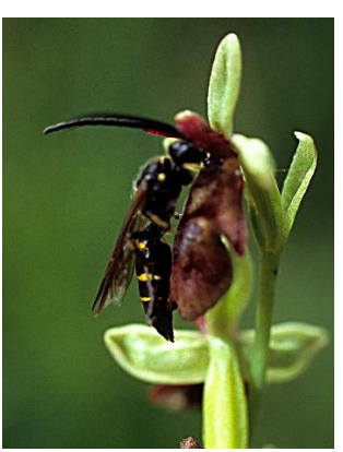
Digger wasp on a fly orchid at Noar Hill, Hampshire, Nigel Johnson

All the images from the 2018 and the previous <u>BSBI Photographic</u> <u>Competitions</u> are available to view on the <u>BSBI's Flickr photograph</u> <u>collection</u>. There are albums for each of the competition categories such as "Plants & People" and "Plants & Pollinator" in 2018. Click on the album you'd like to look at. You can see them in a timed slide show, big or small photograph tiles, depending on which of the three options you select at the top right.