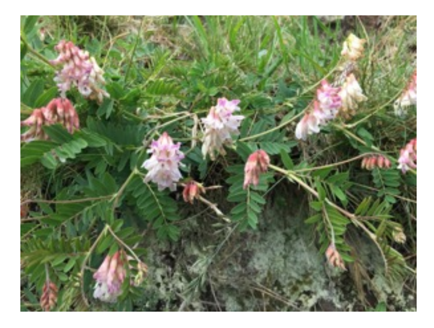
Vicia orobus (Wood Bitter-vetch) Above the Clyde at Clyde's Bridge, near Abington, 10th June