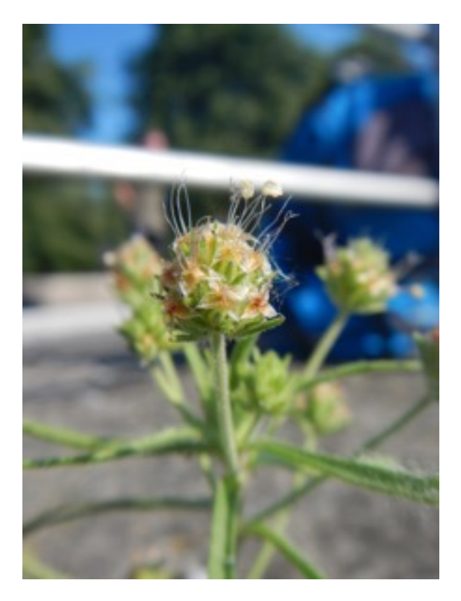
Plantago afra (Branched Plantain) Near Glasgow Science Centre, 25th June (only the 4th location for this species in Scotland)

Here are a few of the 'WOW' moments from this season so far . . .