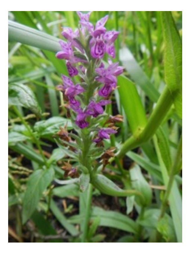
Dactylorhiza purpurella var. cambrensis (variant Northern Marsh-orchid) Lochend Loch, near Coatbridge, 7th July

And here are two very special inhabitants of our deep, damp gorges. Not easy to get to, but this natural barrier to casual visitors helps ensure the prosperity of such species.