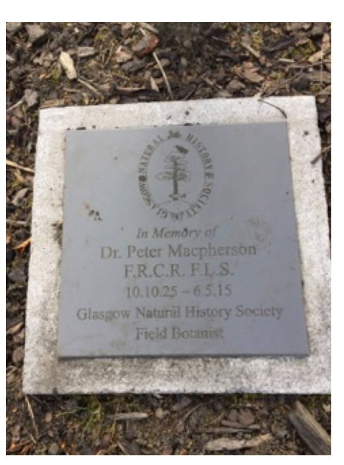
The memorial plaque

The separate recording of the Garscube Estate took place on 3rd August. In the morning we recorded the area of NS5570 east of the Kelvin (over 140 species) and in the afternoon carried out a similar exercise on the west side of the river.