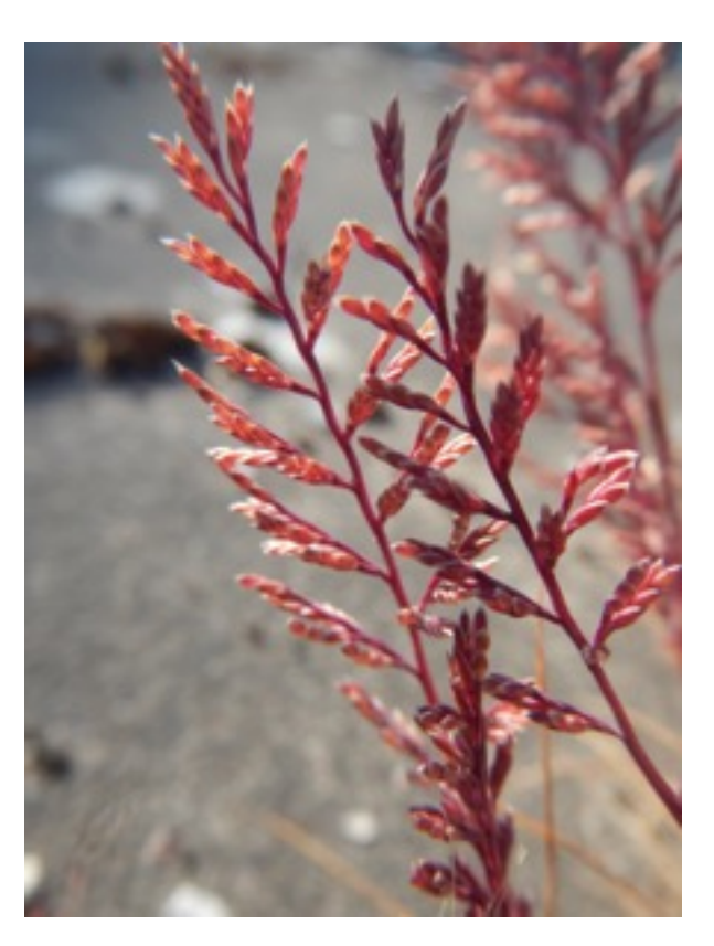
Catapodium rigidum (Fern Grass) Also near Glasgow Science Centre, 25th June (just the 2nd location for this species in Lanarkshire)