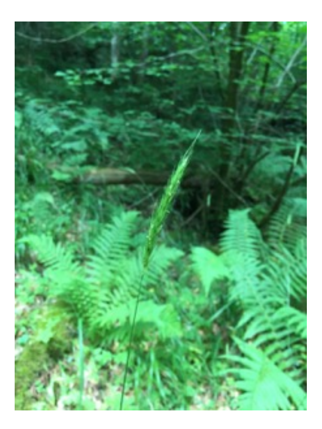
Hordelymus europaeus (Wood Barley) (the only place in Scotland where this is now known)