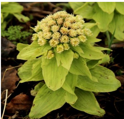
Petasites japonicus .