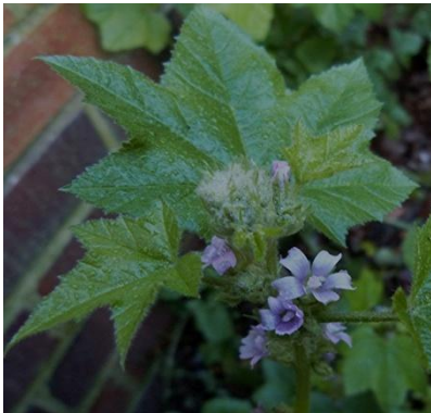
Malva verticillata.