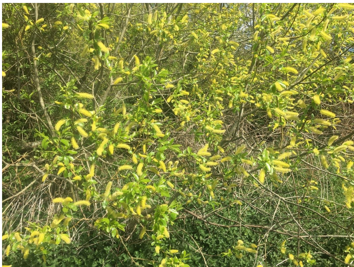
Bay Willow ( Salix pentandra ) by the Lark below Mildenhall

Hedges apparently play an increasing role in the Fenland landscape, with significant new mixed plantings over recent decades. Similarly, concerns about wind erosion and protection of more tender crops has led to planting of shelter-belts of poplars and alders (notably Alnus cordata and A. incana ) in some parts of Fenland. True woodlands remain rare, and the vast majority are planted in origin. Locally, more natural wet woodland has developed, especially in the floodplains of the rivers entering Fenland from East Anglia. Urtica dioica subsp. galeopsifolia was found in Suffolk under alder and willow carr; the “Fen Nettle” was also recorded in shade at Roswell Pits and probably remains under-recorded in the region. Within the treed fringe of the rivers Lark and Little Ouse, the mainly northern Bay Willow ( Salix pentandra ) is occasionally seen and occurs in similar sites by the Slea.