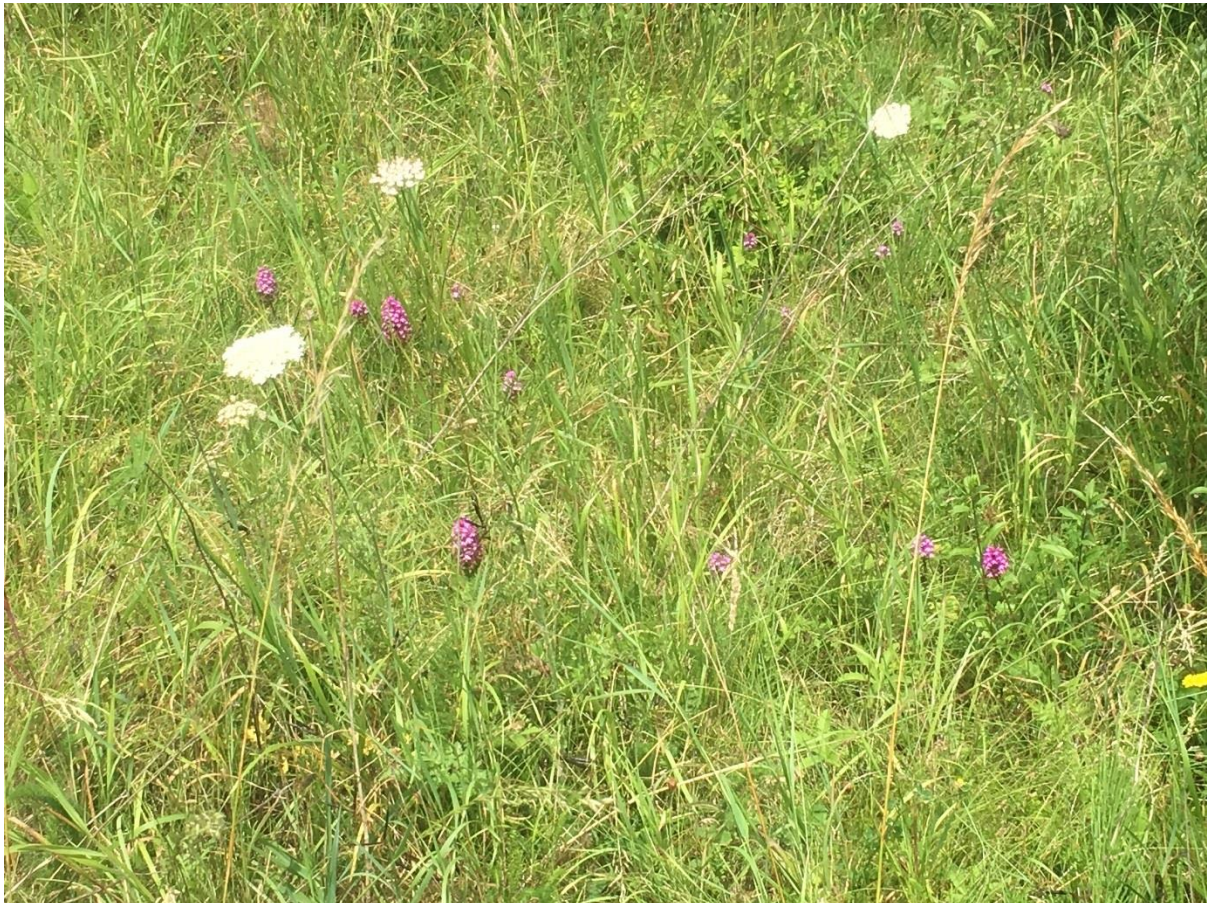
Species-rich grass verge of the A17 with Pyramidal Orchid ( Anacamptis pyramidalis ) at Gedney

This richness may result partly from sowing but also via imported soil or construction materials and the more frequent cutting regimes required on major roads. The A17 in southeast Lincolnshire proved especially interesting in 2017. We found Great Horsetail ( Equisetum telmateia ) on ditch banks here in its only South Lincolnshire Fenland site – first found here by Brian Hedley in 1999. Two species made major extensions in their range: Greater Burnet-saxifrage ( Pimpinella major ) reaching Saracen’s Head and Wild Marjoram ( Origanum vulgare ) getting to Long Sutton. Bushy verges at Gedney supported a fine population of Pyramidal Orchid ( Anacamptis pyramidalis ). These modern trunk-road verges often have amenity planting with shrubs, many of which are non-native strains of familiar species like dogwood and Viburnums. However, Creeping Willow ( Salix repens ) made an unexpected sighting on a verge at Weston, near Spalding.