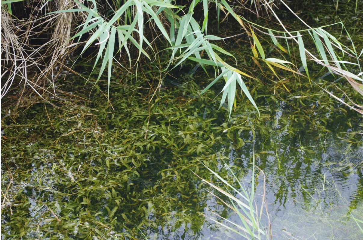
Long-leaved Pondweed ( P. x angustifolius) filling a clear ditch in the Underwoods Grounds area, Whittlesey