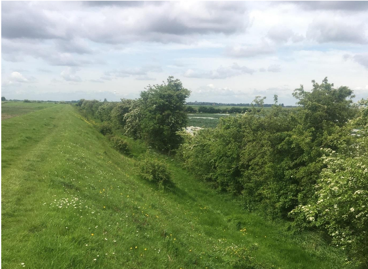
Forb-rich grassland on the sea-bank near The Horseshoe, Wrangle

We continued to find interesting grassland species on the swards associated with both sea-banks and the floodbanks of rivers and drains. Many of these grasslands are quite old by Fenland standards, but in any event are less likely to receive agrochemicals, though some are neglected and thus dominated by coarse grasses. Although Crosswort ( Cruciata laevipes ) is mainly an upland edge plant, it penetrates to the heart of Fenland on drain banks like those of the South Forty Foot. Narrow-leaved Birdsfoot-trefoil ( Lotus tenuis ) turned up near the huge St German's pumping station and close to the Welland outfall on a low sea-bank. Where the mowing regime was suitable and the sward more open, an apparently ordinary drain-bank between Rampton and Cottenham supported both Fiddle Dock ( Rumex pulcher ) and Corn Parsley ( Petroselinum segetum ), this last species being something of a speciality of old floodbanks in Fenland.