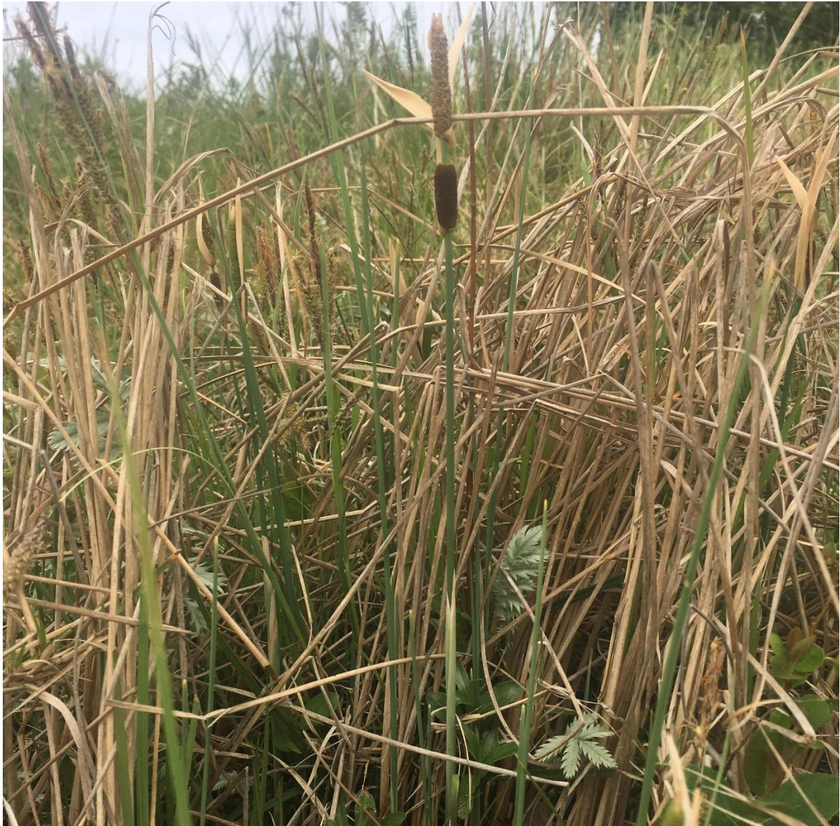
Typha minima established on a common near Soham