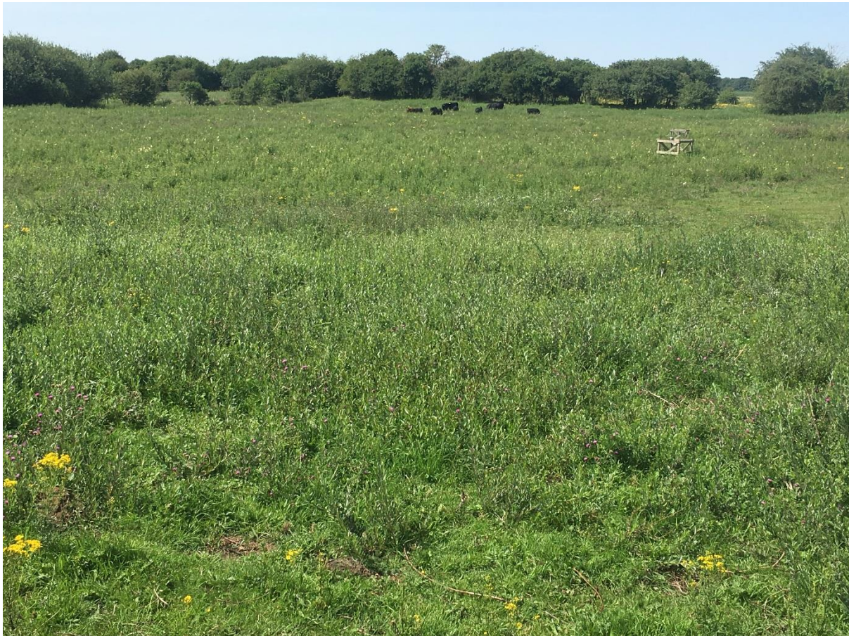
Lakenheath Poor's Fen with abundant Creeping Willow ( Salix repens ) and ragwort invading the intensely grazed portions

The botanical delights of the Breckland may overshadow the value of some of the peaty wetlands along its boundary with the Fenland e.g. Lakenheath Poor's Fen and Pashford Pools Fen. Numerous Suffolk botanists have visited these sites over the years and their flora contains numerous species that are otherwise largely confined to the big NNRs. In the summer of 2017, we visited these fens ourselves finding the riches of Pashford essentially intact but Lakenheath Poor's Fen showing signs of over-grazing meaning that the continued presence of some species was very difficult to ascertain, though the lovely Knotted Pearlwort ( Sagina nodosa ) was possibly favoured by the management regime.