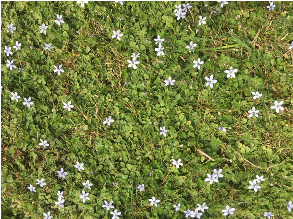
Pratia pedunculata on a mown and shaded grass verge at Gedney Dyke

Highway; and d) Harpur-Crewe's Leopard's-bane ( Doronicum x excelsum ) was well-established and decorative under the avenue of trees through Carrington (the second record for North Lincolnshire). The delicate Pratia pedunculata resembles a tiny lobelia and survives well in slightly shaded closely mown grassland such as lawns and village road verges – a habitat beloved of other aliens such as Oxalis exilis , Pilosella aurantiaca and Potentilla indica . Fenland Flora surveys produced the first record for South Lincolnshire in 2014 at Weston Hills, and the 2017 surveys led to the second vice-county record at Gedney Dyke.