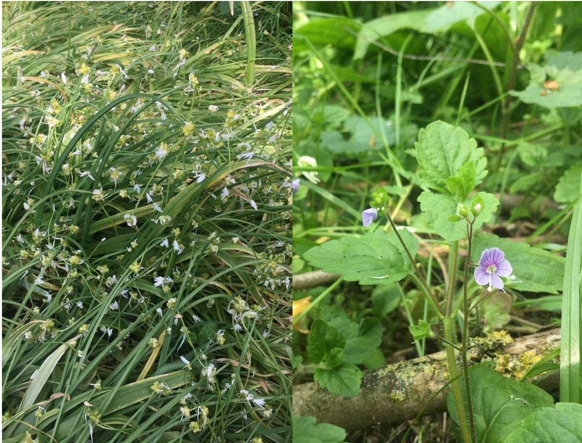
Woodland species of the Wainfleet All Saints fens. Left: Few-flowered Leek ( Allium paradoxum ); and Right: Wood Speedwell ( Veronica montana )