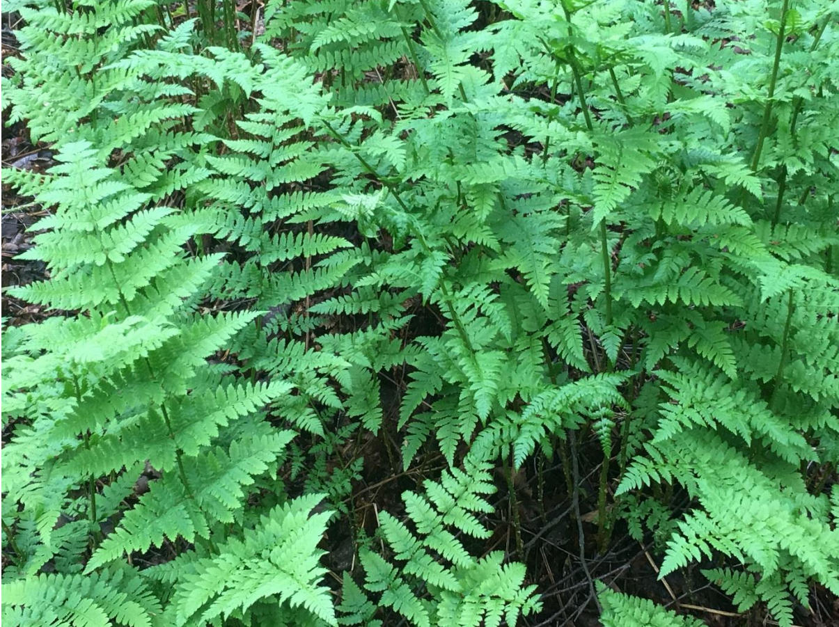
Narrow Buckler-fern ( Dryopteris carthusiana) at Holme Fen NNR