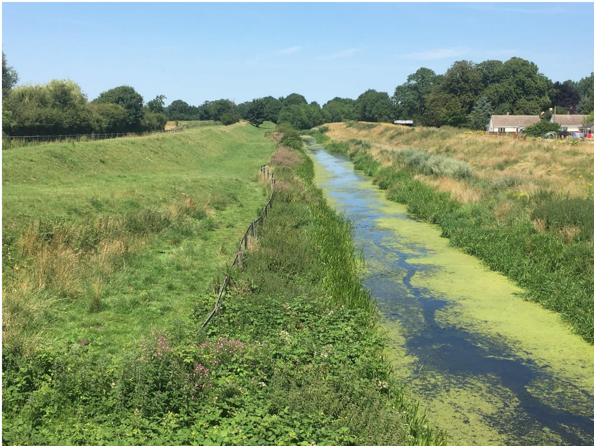
The Fenland boundary – the Cut-off Channel at Lakenheath