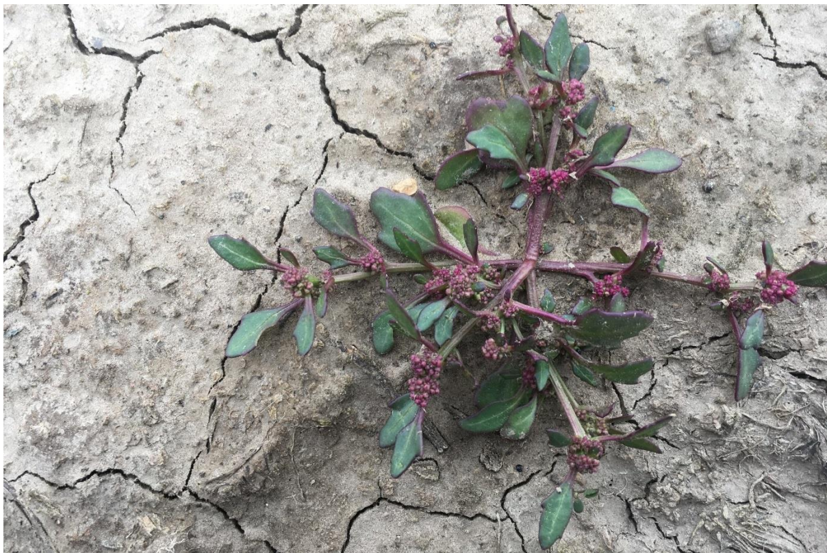
Possible Saltmarsh Goosefoot ( Chenopodium chenopodioides ) from Moulton Marsh

Thanks to several commissioned surveys of the Wash saltmarshes, some performed by Jon, we have a fairly good idea of the halophytic flora of the Fenland coast. Some of the observations discussed in the grassland section (e.g. Lotus tenuis ) could be described as coastal, occurring as they do on grazed sea-banks immediately adjacent to the tidal marsh. In September 20107, Jon and Owen studied the extent of Slender Hare's-ear ( Bupleurum tenuissimum ) at its known location on the RSPB Frampton Marsh reserve. Once we had "calibrated our search image" for this rather insignificant plant, we made a population estimate of maybe as much as 10,000 individuals!