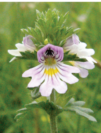
Euphrasia rostkoviana .

Stems 10-40(50) cm, green or slightly reddish, erect. Cauline internodes shorter to 3 times as long as leaves, lower floral internodes shorter to 4 times as long. Branches 1-12 pairs, slender, ascending or erect, often branched again. Leaves bright green and often conspicuously veined below. Cauline leaves 3-17mm, suborbicular or broadly to narrowly ovate, obtuse at the apex with 1-7 pairs of obtuse to subacute teeth, not much longer than wide, sessile or rarely shortly petiolate, with a truncate or rounded base. Lower floral leaves 6-15mm, generally smaller than the upper cauline, deltoid or broadly ovate to oblong-ovate, obtuse to acute at apex with 4-9 pairs of subacute to acuminate teeth, not much longer than wide, the basal pair patent or retrorse, sessile with a rounded, truncate or cordate base. All (save sometimes the lowest leaves) with more or less dense, long multicellular glandular hairs with the stalk 10-12 times as long as the gland. Lowest flower at node 6-10(14). Corolla (6.5)8-12 mm, white or with a purple or lilac upper lip. Calyx green, teeth narrowly or very narrowly deltoid, acuminate