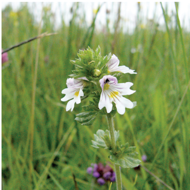
Euphrasia rostkoviana .