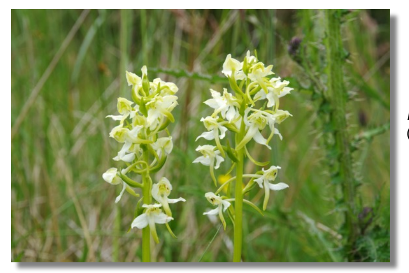
Platanthera chlorantha (Greater Butterfly Orchid)

The first instalment of the programme (for April and May) will be emailed out in early March.