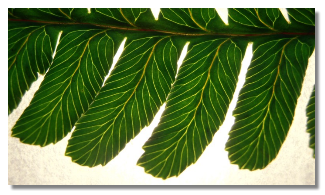
Dryopteris affinis ssp. affinis (close-up showing vein pattern)

Most ferns die back over the winter, but a prominent winter survivor is the evergreen Dryopteris affinis (Scaly Male Fern). Many people baulk at identifiying the subspecies, but the main one which remains dark green through the winter is Dryopteris affinis ssp. affinis . (Other similar species, Dryopteris borreri, Dryopteris cambrensis and Dryopteris filix-mas , are much less likely to be found in winter.)