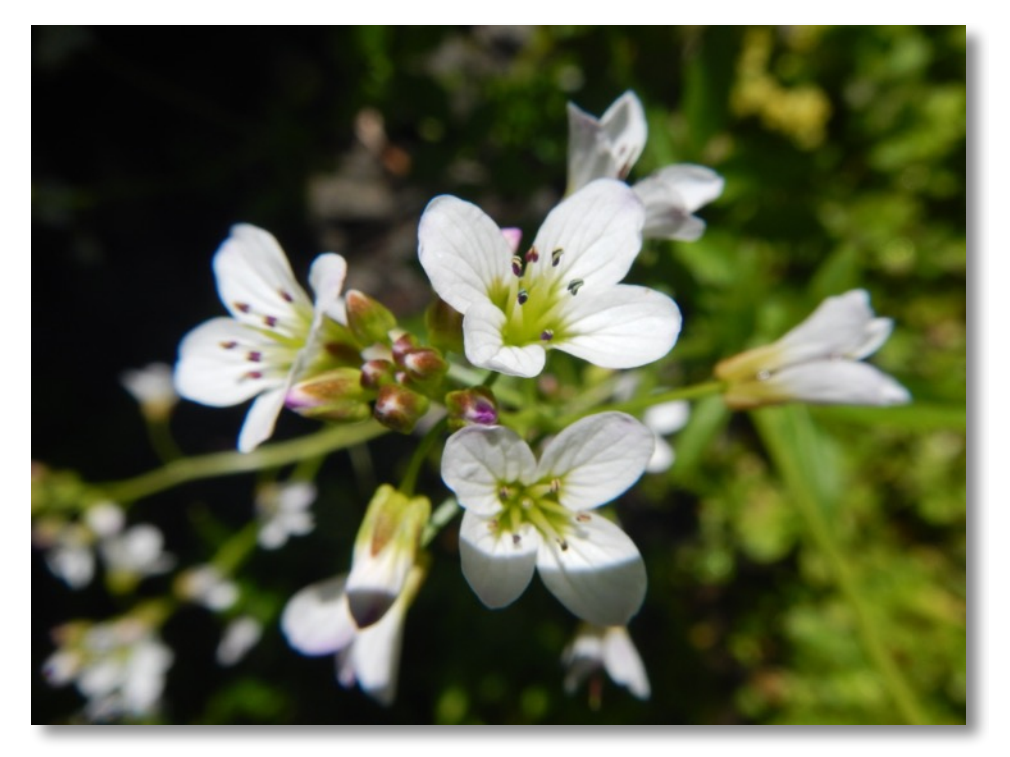
Cardamine amara (Large Bittercress) with its distinctive violet anthers

Our fieldwork programme was packed with outings, both at weekends and some weekday evenings, and included rich rural areas, fascinating urban sites and some of our more remote hill country.