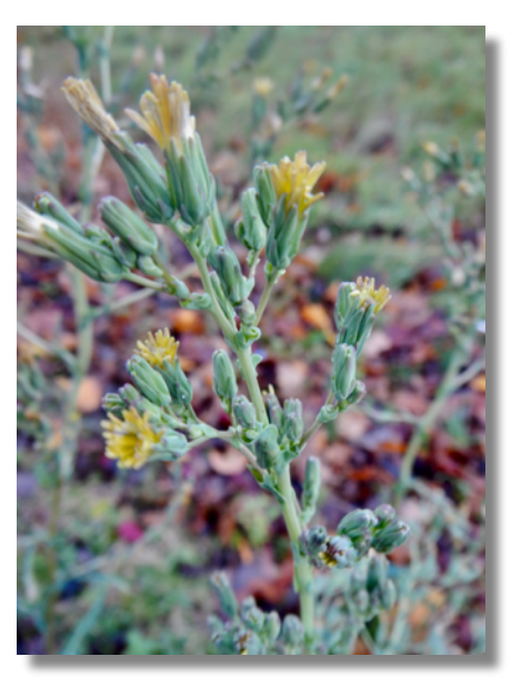
Lactuca serriola forma integrifolia (with unlobed leaves)