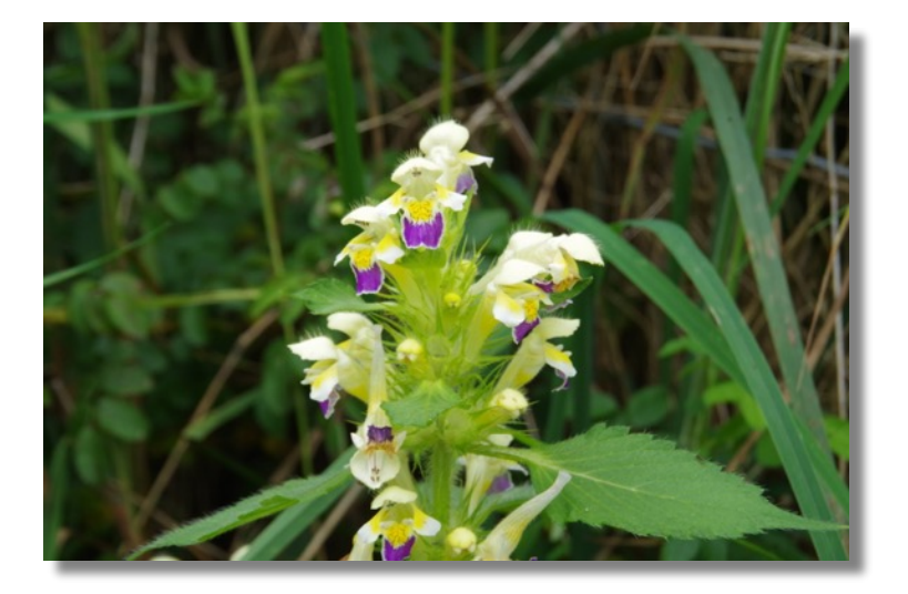
Galeopsis speciosa (Large-flowered Hemp-nettle)

Closer to home, our own outings are always a great way to learn plants!