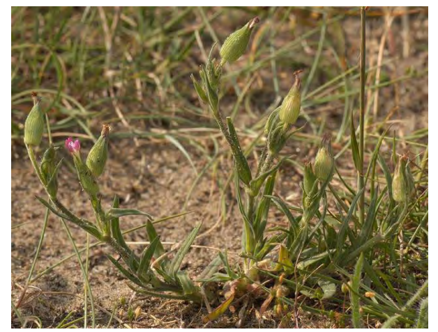
Silene conica at Sandwich golf club, east Kent.

Flowers are 4-5 mm across with rose-pink to violet-red petals that have a pronounced notch at the apex. Plants have an ephemeral rosette of linear to spathulate basal leaves and 3-4 pairs of unstalked linear-lanceolate downy stem leaves that are acuminate and often widened towards the base (Jonsell 2001)