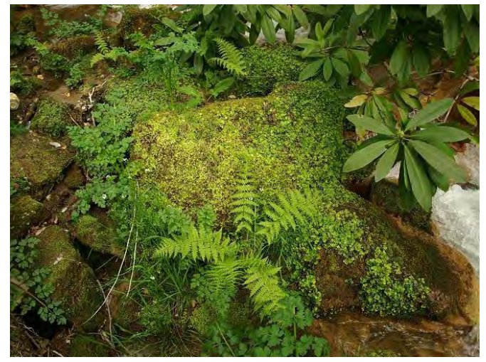
Sibthorpia europaea at Smallhanger Waste, Devon.

There are a number of similar winter-green species, including Chrysosplenium alternifolium , C. oppositifolium , and Glechoma hederacea , but they are readily separated in the field (Pearman 1998). C. alternifolium has minute glandular-hairs on the leaves and much longer petioles (to 9 cm), C.