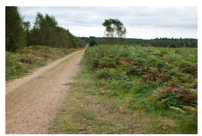
Ride edge habitat with Potentilla argentea at Methwold Warren, part of the Breckland SAC, west Norfolk.

Flowers (10-15 mm across) are in terminal cymes with five obovate-wedge shaped yellow petals (4-5 mm) that equal or barely exceed the ovate-lanceolate sepals.