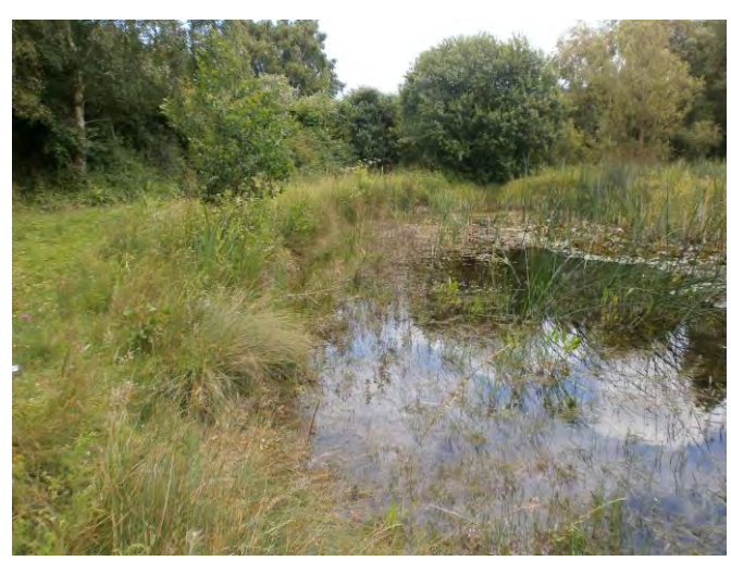
Bainton Ponds, Northamptonshire, where Oenanthe fistulosa grows with Baldellia ranunculoides.

The umbels (1-3 cm) are few-rayed (2-4), with the stout peduncle longer than each ray. Bracts (not to be confused with the linear bracteoles, of which there are 7-16) are absent. The