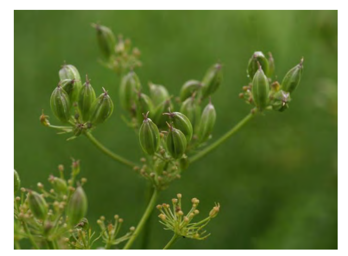
Close-up of fruits of Meum athamanticum , photographed at Keltneyburn, Mid-Perthshire.

Vegetative plants may be confused with Carum verticillatum,