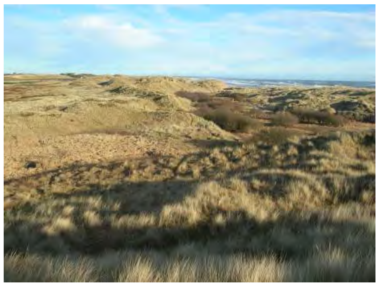
South end – N side of Blairton links, looking over SINS site and Blairton burn Above: 31 January 2007. Below: 22 November 2011