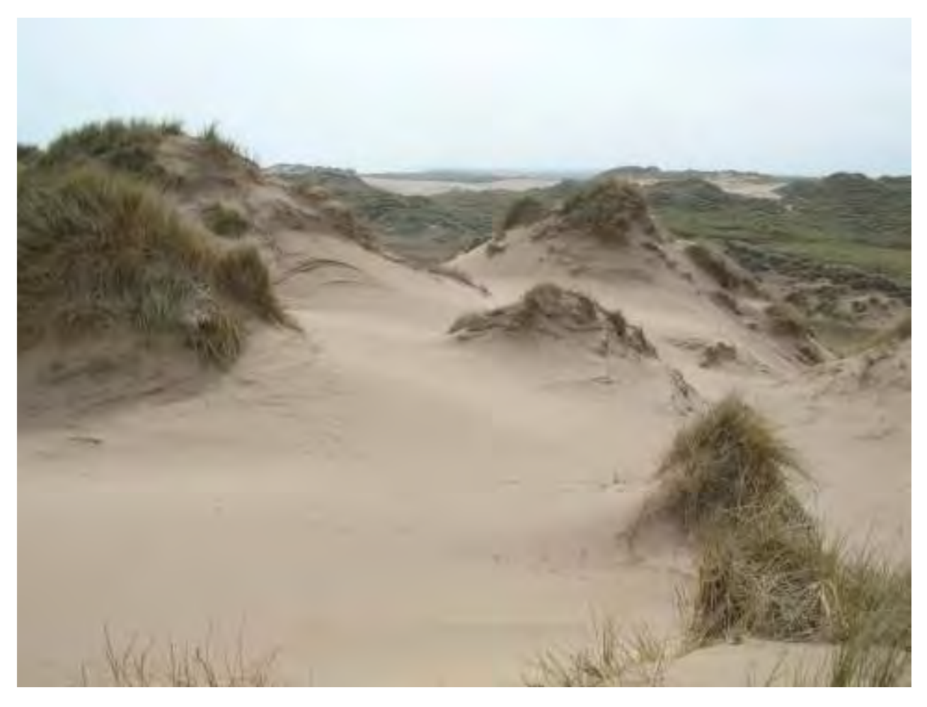
General comparison of change (not same locations) – south part of SSSI section Above: 22 April 2008. Below: 22 December 2011