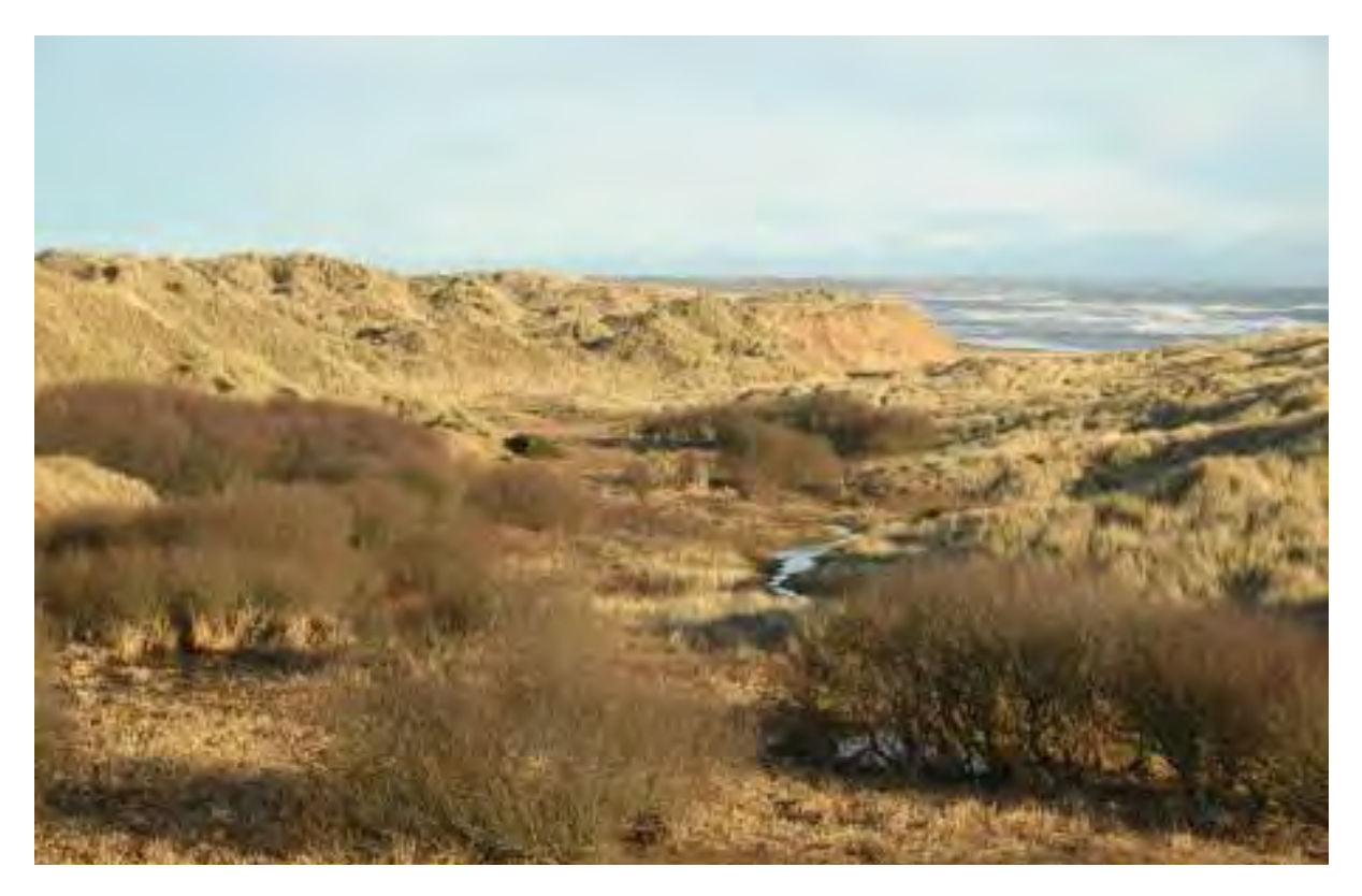
South end – N side of Blairton links, looking over SINS site and Blairton burn Above: 31 January 2007. Below: 22 November 2011