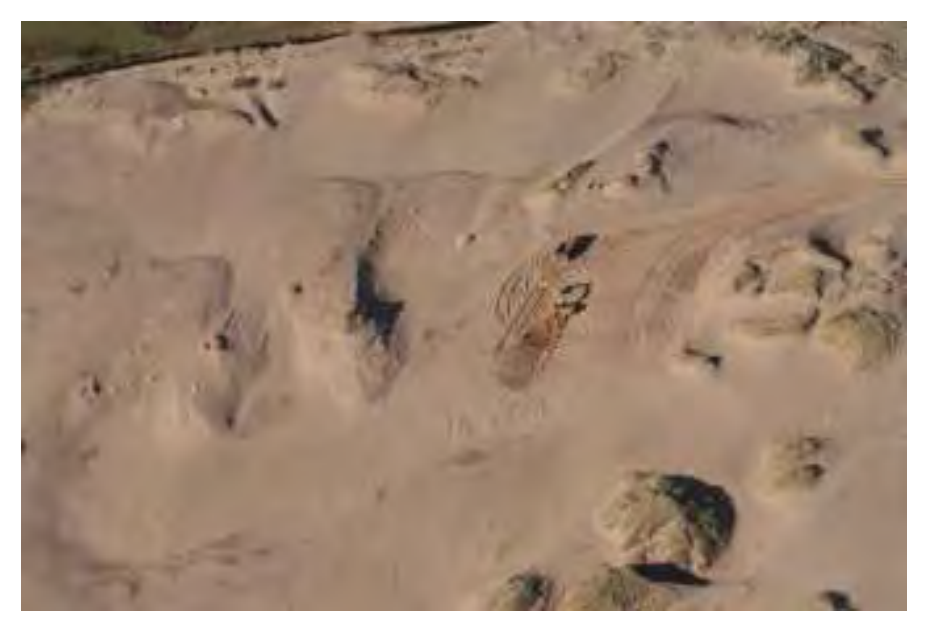
"Biblical amounts of sand" (Martin Auld, in PLI)