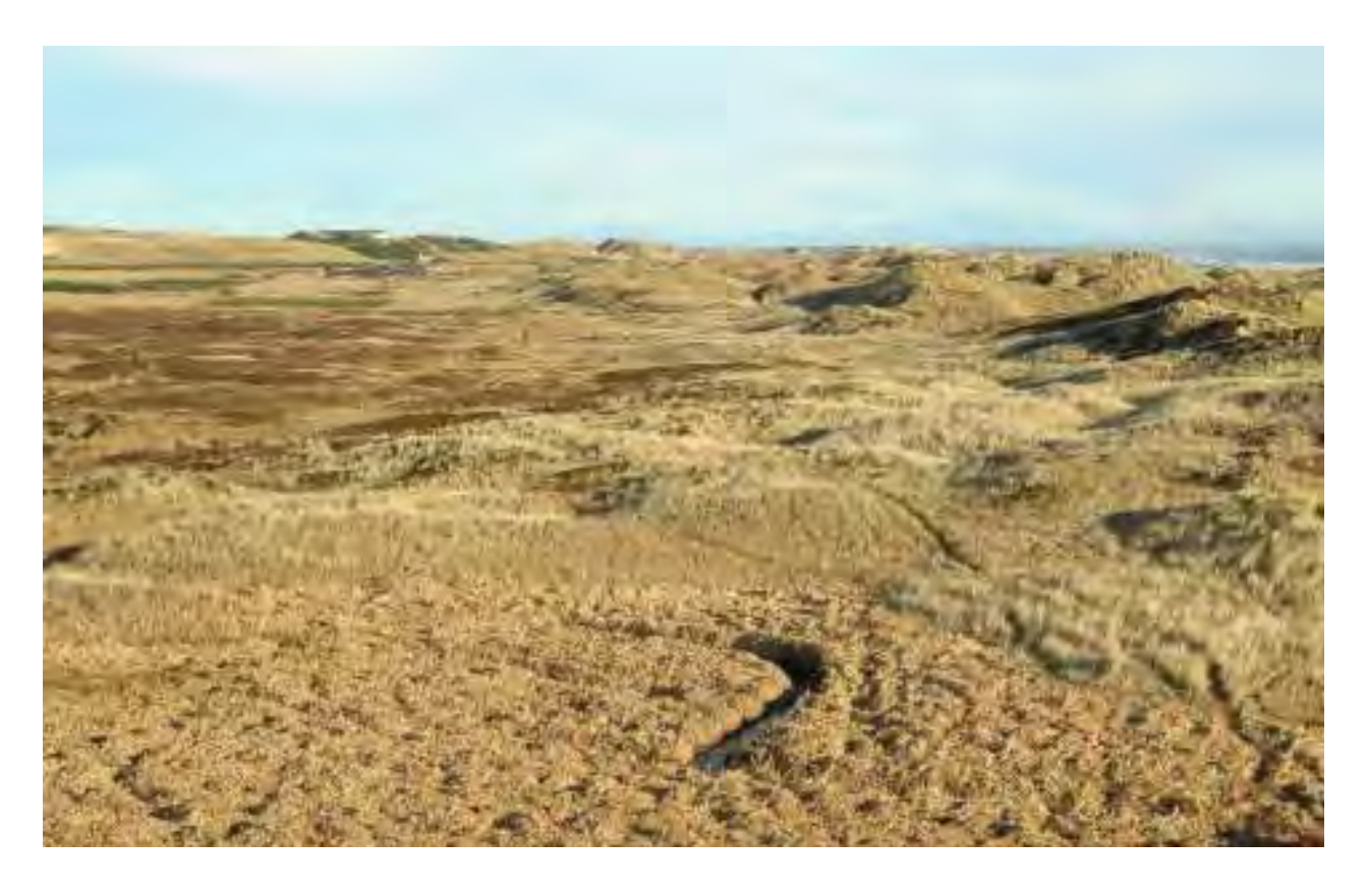
South end – N side of Blairton links, looking over SINS site and Blairton burn Above: 31 January 2007. Below: 22 November 2011