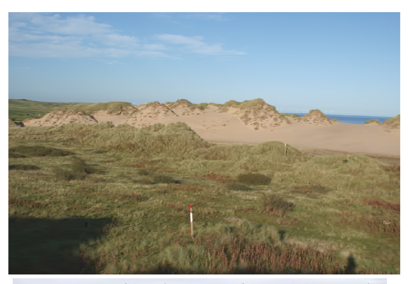
General comparison of change (not same point of photography but same area) – north part of SSSI section. Above: 26 September 2009. Below: 22 December 2011