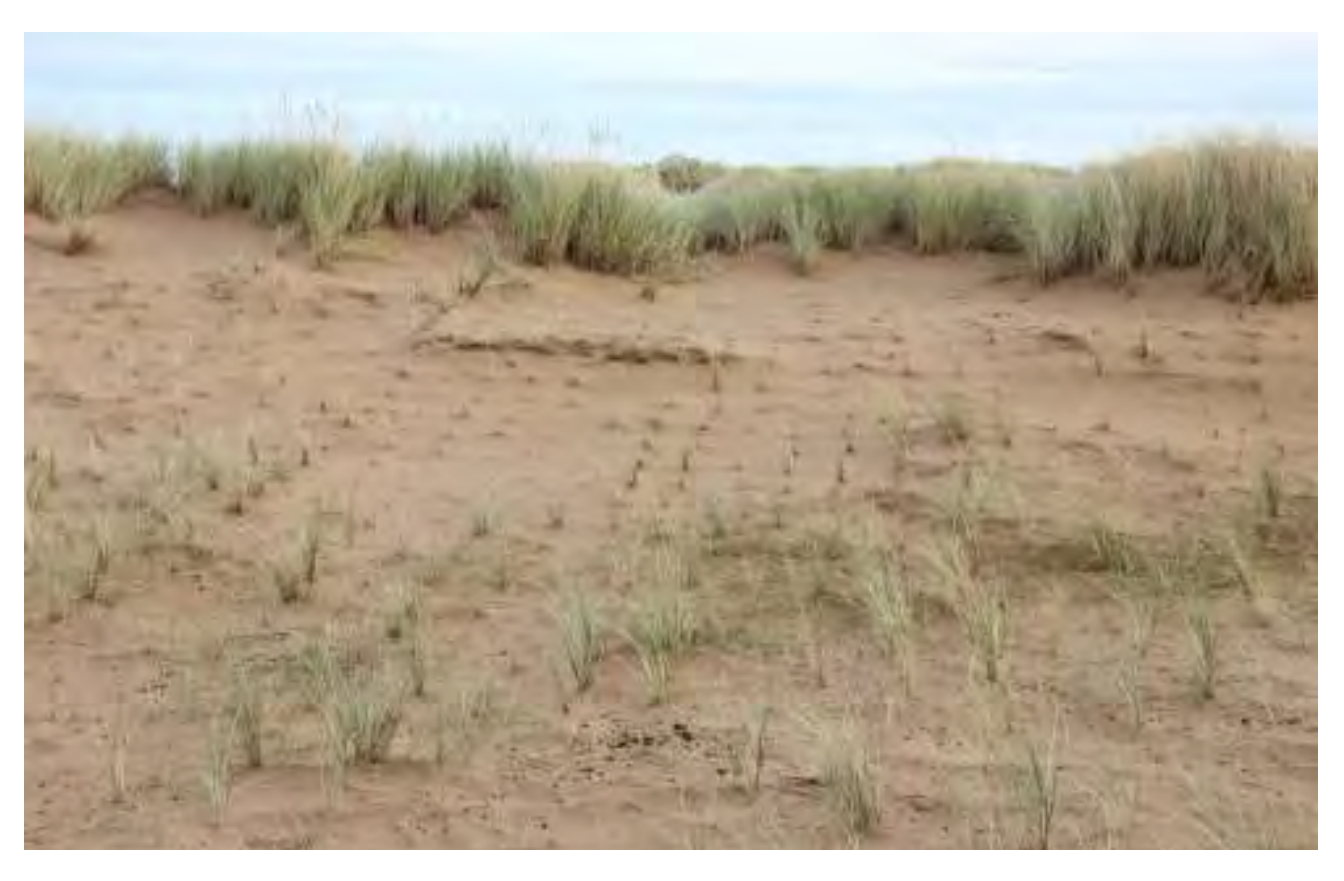
Marram grass planting, undersowing and use of paling fences to stabilise dunes – north part of SSSI section. 22 December 2011