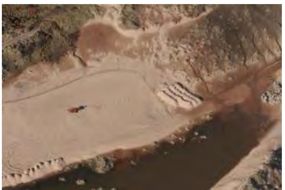
Aerial photographs of habitat destruction underway on SSSI part of site 1 March 2011