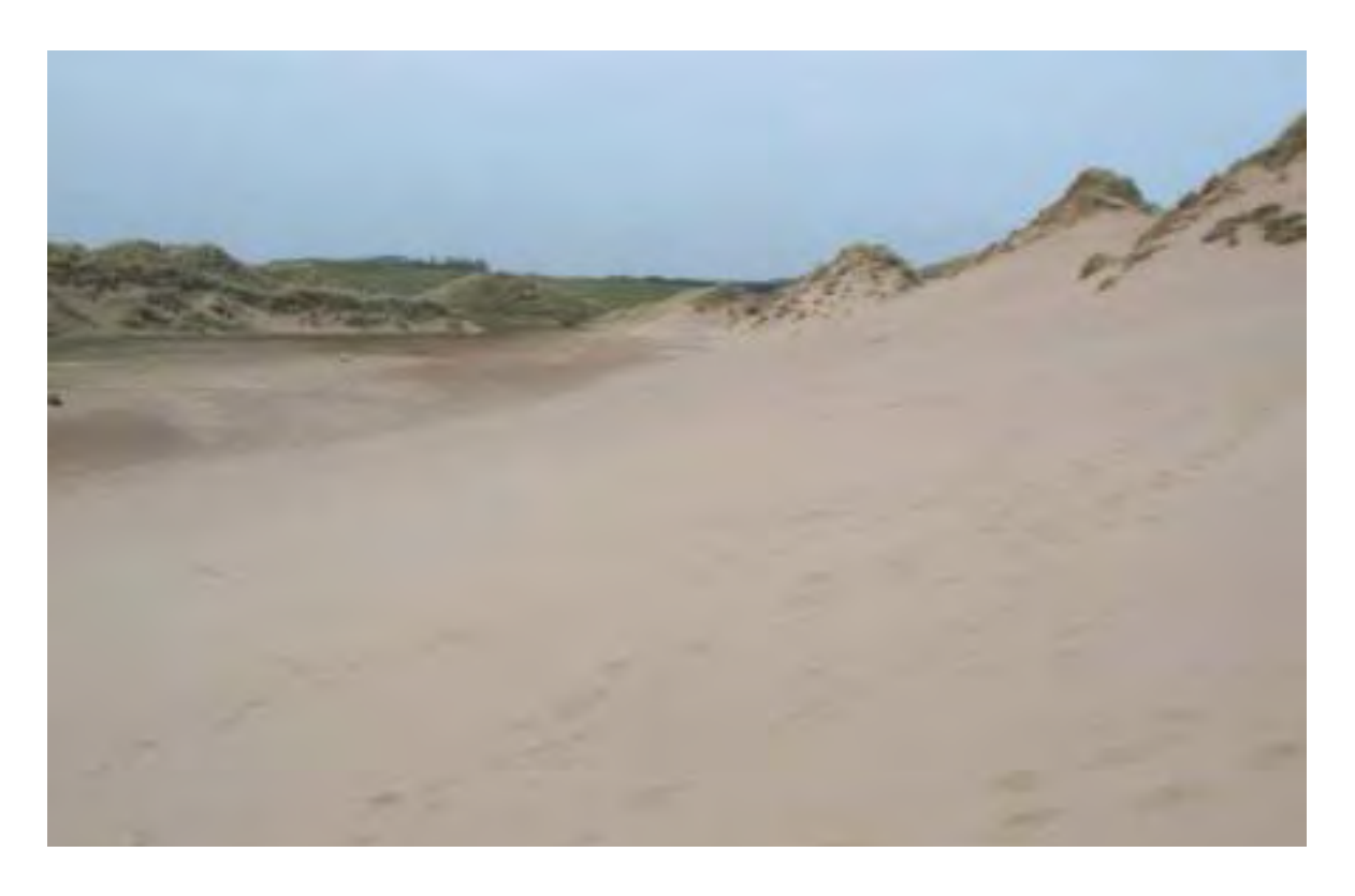
Comparison of change (not same point of photography but shows some of same area) – north part of SSSI section. Above: 22 April 2008. Below: 22 December 2011