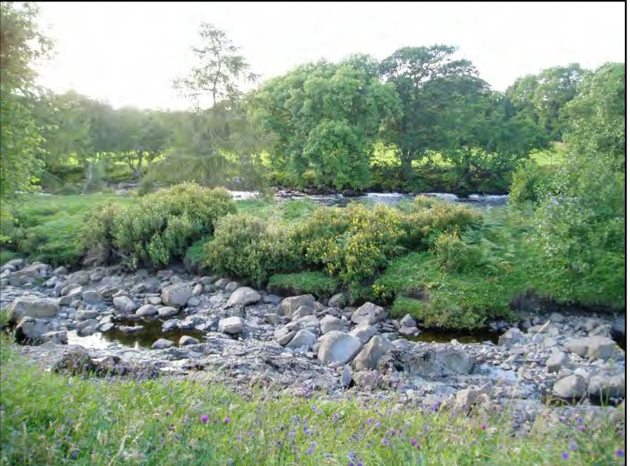
Rocky islets with Shrubby Cinquefoil

When you arrive at the ferny Holwick Bridge, NY889283, you have a choice of routes. Staying on the south, Yorkshire side takes you up into the largest English area of Juniper. There are some cautious viewpoints from the top of High Force. This walk could be continued to join up with the Cronkley Fell route, 4 km further on.