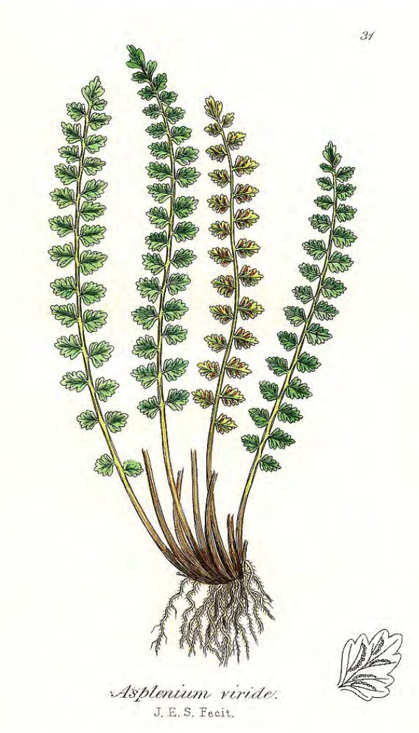
6 <sup>th</sup> April Longshaw Meet in NT Wooden Pole car park at SK266790 on A625 junction

For use on the day of meetings my mobile phone number is 0794 121 4977.