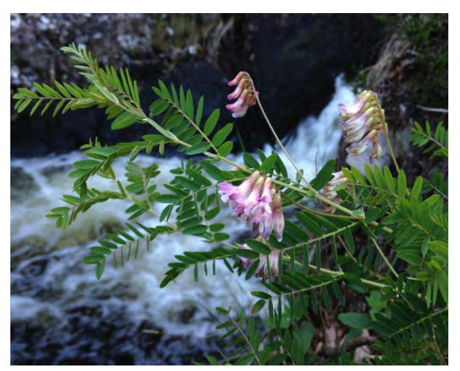
Vicia orobus at Ganllwyd, Merionethshire.

In upland habitats V. orobus can be confused with Lathyrus linifolius subsp. montanus , which also lacks tendrils, but L. linifolius only has four pairs of leaflets and they lack the net-