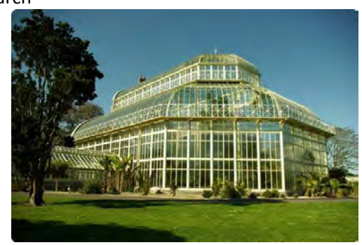
National Botanic Gardens

Talks in the morning and workshops in the afternoon. Details to be confirmed, but we have lots of ideas and plans afoot, and there will be lots to interest recorders. There will be plenty to learn at the workshops, e.g. identification help with some critical groups – we will have experts from both Ireland and the UK. (Don't hold me to it, but possible themes include: aquatic plants, Euphrasia ID and Viola ID.)