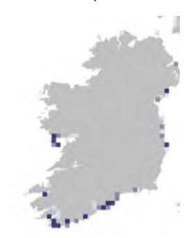
Distribution of Crambe maritima, Atlas 2000.