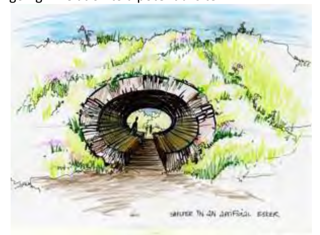
Drawings and plans from the Galway Botanic Garden website

The group state that their aims are to educate about, research and conserve native Irish plants. Their educational plan includes adult workshops, student and schools programmes, and exhibitions, as well as a chance for visitors to learn about the plants they will encounter on their adventures in the west of Ireland. They also aim to have a living seed bank with the aim of protecting our biodiversity for the future. And here's where they feel that BSBI members can help!