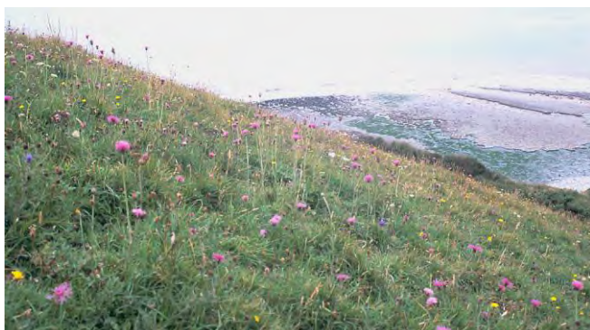
Cirsium tuberosum population in coastal turf at Cwm Nash, Glamorgan, where the hybrid with C. palustre is also found. ©Kevin Walker.

On the continent C. tuberosum occurs in a greater range of habitats including wood-borders, damp meadows, ditches, shore margins and gravel pits. Here the most characteristic community is the calcareous purple moor-grass meadow ( Cirsio tuberosi - Molinietum ; Ellenberg 1988; Oberdorfer 2001), dry variants of which are related to mesotrophic grasslands of southern England and Wales.