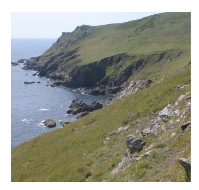
South-facing cliff slopes at Start Point, S. Devon, looking out to Peartree Point. The grassland in the foreground contains both L. angustissimus and L. subbiflorus

Lotus angustissimus is a few-flowered (usually 1 - 2 per head) annual with a covering of patent hairs. The small pale 'egg-yolk' yellow flowers are held on short pedicels, and the keel of the flower, as seen in the picture above, has an almost right-angled bend to it about halfway along the lower edge of the limb (Stace, 2010), as well as a short, straight-tipped beak (Kramina, 2006).