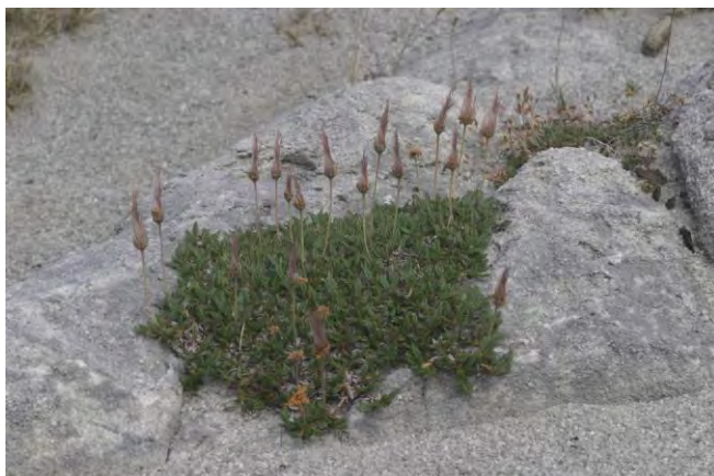
Fruiting Dryas octopetala on sugar limestone at Cronkley Fell, north west Yorkshire.

Dryas octopetala is unmistakable in all stages of growth and is unlikely to be confused with any other British or Irish species. There is, however, considerable variation in leaf size and hairiness between British populations, some of which appear to be genetically controlled (Elkington 1971; Bradshaw & Doody 1978). Plants in Teesdale have small leaves that most closely resemble plants in exposed locations in the Arctic (Pigott 1956) but they have not been recognized as a separate