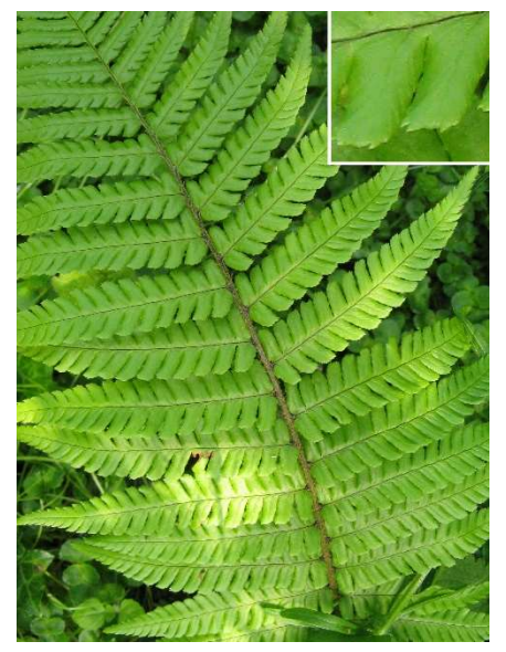
One of the ferns we saw in the woodland near Morfa Ystradowen was this good specimen of Dryopteris borreri (Borrer's Male Fern), with truncate ends to the parallel-sided pinnules.

We then moved out onto the open part of the 'moor' west of the Nant Rhydhalog, and quickly found an abundance of Dryopteris carthusiana (Narrow Buckler Fern), which is rather local in the vice-county. Apart from this, however, the area yielded only a thin scattering of interesting species, being badly undergrazed, mostly rather dry underfoot, and characterised by abundant coarse grasses and Filipendula ulmaria (Meadowsweet). Sedges were also rather scarce, but we were able to compare Carex riparia and