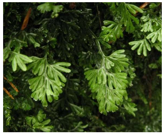
Hymenophyllum tunbrigense at Daren y Dimbath (taken in October 2013).

A range of sizes of plants were recorded, both species showing the classic exponential declines in numbers of patches with increasing size. However, one medium-sized patch of H. wilsonii and one huge patch of H. tunbrigense were peeling off the rocks under their own weight, leaving fragments of rhizome in crevices, which were then regrowing. As a result, small patches may not necessarily indicate regeneration from spores.