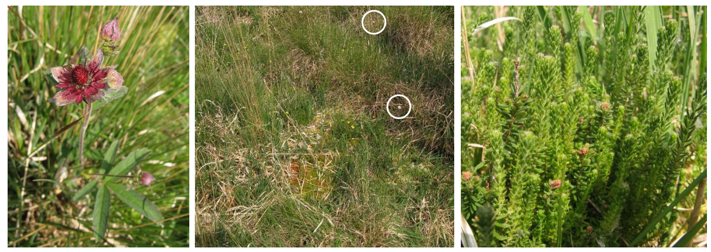
Comarum palustre (left) was a highlight in the 'burnt' field, while a tiny area of acid 'bog' (centre) yielded a little Eriophorum vaginatum (Hare's-tail Cotton-grass, circled), Erica tetralix (Cross-leaved Heath, right) and Calluna vulgaris (Heather).

The old railway itself was clearly regularly mown, affording a pleasantly shady walk. The wet woodland to the west looked promising (but, we reckoned, probably better in spring), while Berula erecta (Lesser Water Parsnip) was noticed in a ditch on the eastern side. Scrambling down the bank, we emerged into an area of very tussocky grassland that had been subject to a light burning, probably early in the year. Dryopteris carthusiana was again abundant here, but more interesting was plenty of Ulex gallii (Western Gorse), a 2m × 2m patch of Comarum palustre (Marsh Cinquefoil), and a tiny remnant of Sphagnum 'bog' with typical acid-loving species.