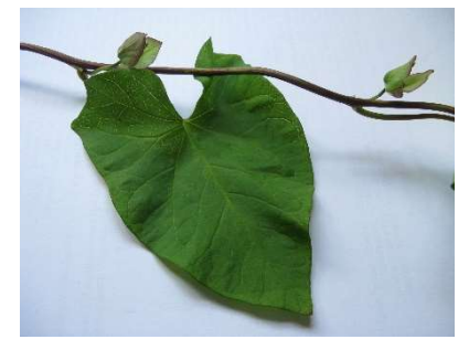
This hairless Calystegia found in Cwmaman village appears to be C. sepium (Hedge Bindweed), but completely lacks a corolla.

amongst ordinary-coloured plants. Finally, a mysterious Calystegia (Bindweed) lacking a 'trumpet' to its flowers was spotted in an alleyway on the way back to the car, to complete an interesting day.