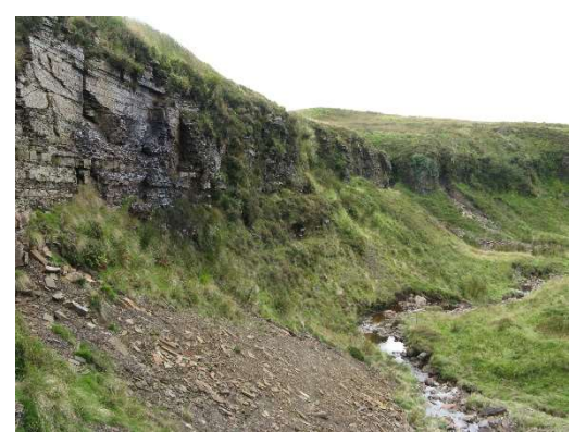
The ravine cliffs of the Nant Morlais, though quite damp and well-vegetated, held nothing out of the ordinary.

Having previously examined the geological map, we were expecting a transition in rock type as we headed northwest, and passing a couple of 'shake holes', it was clear that the limestone was not far below the surface. When it came, the change was remarkably abrupt (see photo), and we then spent some time examining the long-abandoned quarries of Twynau Gwynion. Here we found upland specialities including locally frequent Saxifraga hypnoides (Mossy Saxifrage), and smaller quantities of Cystopteris fragilis (Brittle Bladder Fern), Asplenium viride (Green Spleenwort), and Galium sterneri (Limestone Bedstraw).