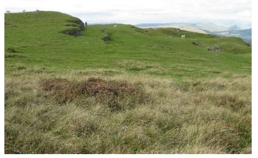
Over a matter of a few metres, the habitat changed from hard quartzy gritstone with Calluna vulgaris (Heather) and Molinia caerulea (Purple Moor Grass) to fine limestone turf with abundant Thymus polytrichus (Wild Thyme). Guess which the sheep prefer!