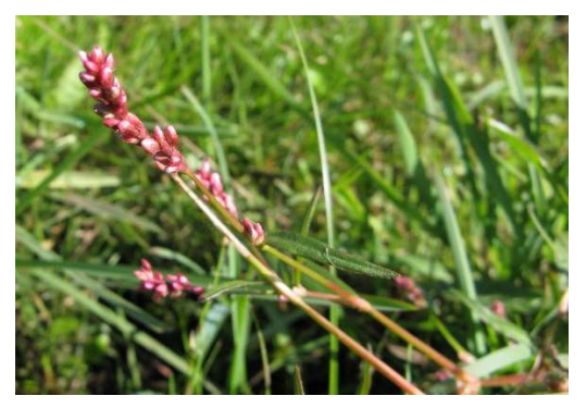
Mirroring our experience on the final excursion of 2015, by the track up to Merthyr Common we turned up a previously unknown population of the county rarity Persicaria minor .