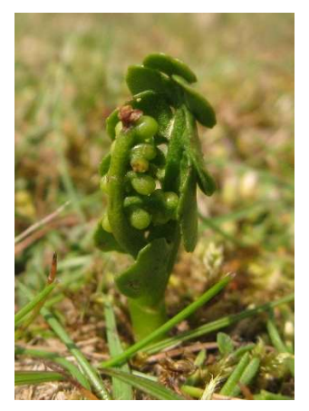
A young spike of Botrychium lunaria in short turf – we found several small colonies in total.

After a descent through mostly uninteresting tussocky grassland, we had little energy left to undertake anything more than a quick inspection at the former gravel workings for the hoped-for annual clovers. However, the coastal shingle just landward of the dune edge provided easier botanising, with the highlight being Valerianella locusta var. dunensis (Common Cornsalad) to round off an enjoyable day.