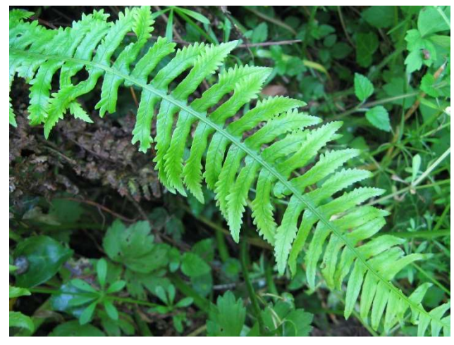
More ferns! Blechnum spicant is common enough on banks on acid soils, but this variant with lobed pinnae was a new sight for even the experienced botanists in the group.

Moving off the old railway, a shady track took us through woodland back up to our starting point, where we came across a variant of Blechnum spicant (Hard Fern). Some of the group returned to their cars at this point, but the rest decided to finish off by examining a field adjacent to the main road. This had presumably been heavily grazed by sheep in the past, because the flora was rather poor and also remarkably uniform. However, Rhinanthus minor (Hayrattle) was abundant, while a few Dactylorhiza fuchsii (Common Spotted Orchid) were found, and the southern end held a population of Myosotis discolor (Changing Forget-me-not) amongst a stand of Bracken.