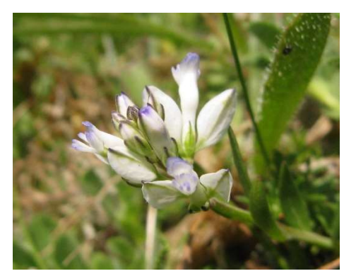
An attractive colour-form of Polygala vulgaris (Common Milkwort) with purple-tipped white petals was found in several places over the dunes.

Our lunch stop – chosen for being sheltered from the wind – was not particularly species-rich, but Karen was astounded to find a detached spike of Botrychium lunaria (Moonwort), presumably 'kicked off' as we had walked in.