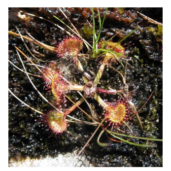
By the sides of the Nant Tor-gwyn we found a few plants of Drosera rotundifolia (Roundleaved Sundew).

Mostly on the rockier ground, we found numerous patches of the local Glamorgan shrub Empetrum nigrum... but we only saw one berry! Given that on this excursion we examined only a narrow strip of this extensive area, the population of this species on the Common as a whole might be quite significant.