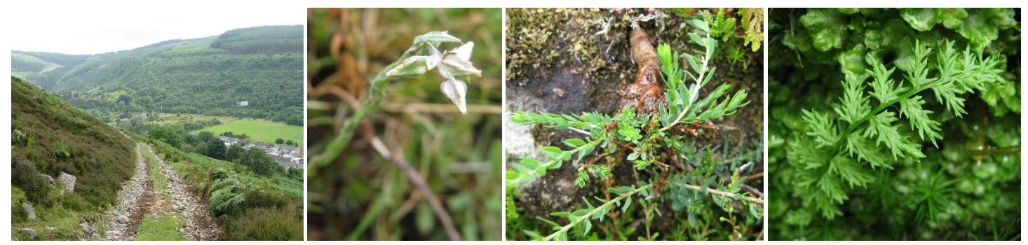
From left to right: A track running down the hillside yielded single plants of Filago minima (Small Cudweed) and Genista anglica (Petty Whin), while a hillside spring at the bottom produced this variant of Athyrium filix-femina (Lady Fern) with strongly divided pinnules.