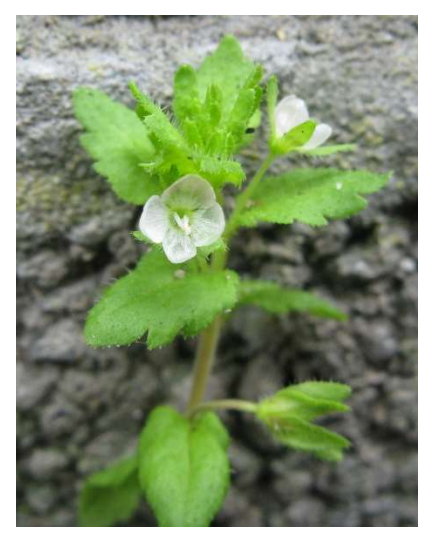
A highlight of Cwmaman village was Veronica agrestis (Green Field Speedwell), which is rarely recorded for this part of the vicecounty.

Moving into our third hectad for the day in an intense but fortunately short-lived spell of rain, we encountered some good heathery ground, which graded into rather species-poor grassland as we ascended above the 300-metre mark.