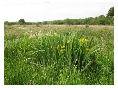
The flowers of Iris pseudacorus (Yellow Flag) brighten up one corner of the rather grassdominated Morfa Ystradowen.

acutiformis (Greater and Lesser Pond Sedge). One area near a ditch had some indicators of damper ground – Equisetum fluviatile (Water Horsetail), Hydrocotyle vulgaris (Marsh Pennywort) and Salix repens (Creeping Willow).