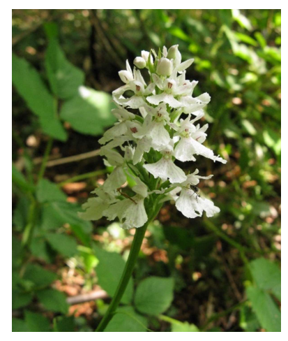
Dactylorhiza maculata (rather pale-flowered in this case) were a surprising find in a rather shady spot.

We then moved out onto the open part of the 'moor' west of the Nant Rhydhalog, and quickly found an abundance of Dryopteris carthusiana (Narrow Buckler Fern), which is rather local in the vice-county. Apart from this, however, the area yielded only a thin scattering of interesting species, being badly undergrazed, mostly rather dry underfoot, and characterised by abundant coarse grasses and Filipendula ulmaria (Meadowsweet). Sedges were also rather scarce, but we were able to compare Carex riparia and