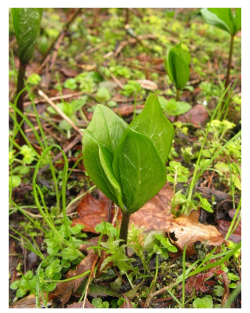
The unfurling leaves of Paris quadrifolia caught our eye in damp ground.