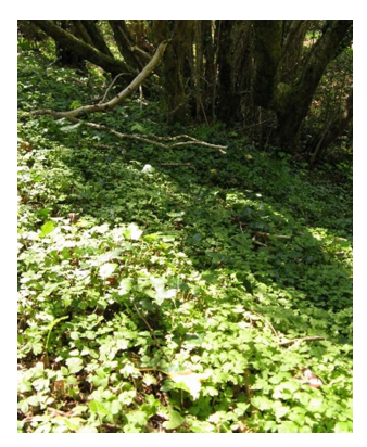
Adoxa moschatellina (Moschatel) was remarkably abundant in woodland on the sandy soils.