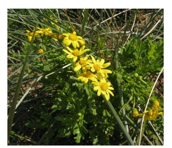
Senecio squalidus (Oxford Ragwort), with its showier flowers than S. jacobea (Common Ragwort), was well-scattered over the dunes.

Recovering from this excitement, we pressed eastward into SS84.77, where we planned to concentrate most of our recording effort. Substantial areas of the dunes were dominated by one or more of coarse grasses, Rosa spinossissima (Burnet Rose), Hippophae rhamnoides (Sea Buckthorn) or Prunus spinosa (Blackthorn), but there were enough areas of shorter turf to make for interesting botanising.