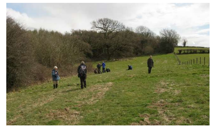
Investigating the small pasture near Coed Nant-brân – here we found abundant Poterium sanguisorba (Salad Burnet) and a scattering of Primula veris (Cowslip).

On the second half of our excursion, we headed east to Coed Nant-brân, but before entering the wood we spent a while in a small pasture at the north-western end, previously known to some of the group for its reasonable calcareous flora. In nearby scrub, Linda Nottage found a couple of plants of Primula veris (Cowslip) × P. vulgaris (Primrose), with both parents in the vicinity.