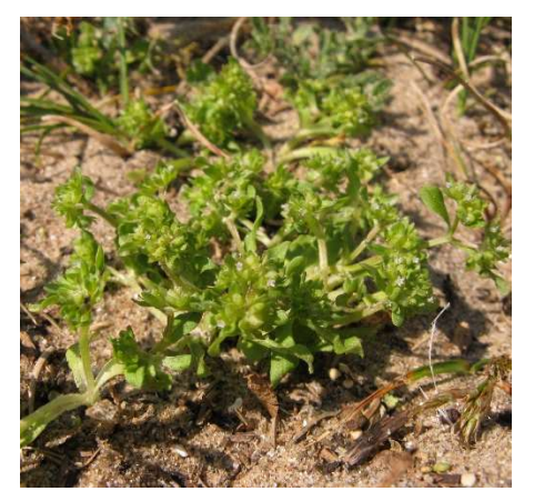
Recorded for the first time in East Glamorgan, variety dunensis of Valerianella locusta was frequentabundant over ~10m × 5m.