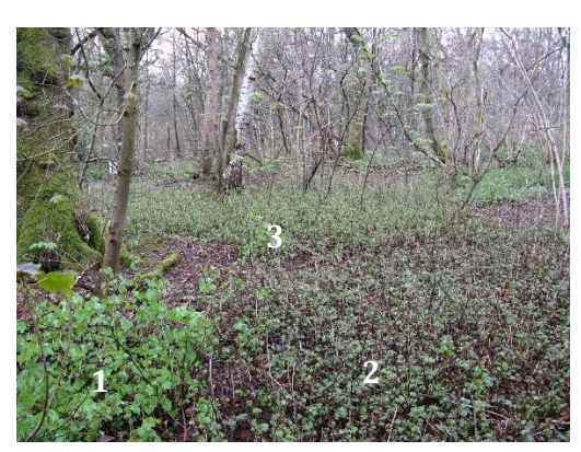
Ribes rubrum was dominant in part of Coed Siôn Hywel. Three clones (1–3) are visible here, with the leaves having emerged to different degrees.

Initial impressions were not particularly favourable, with large parts of the area being covered by clones of Ribes rubrum (Redcurrant) to the exclusion of much else. However, there was a scattering of typical woodland species, including small numbers