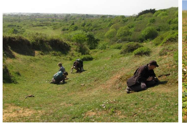
Inspecting the short turf at the ridge-top, where we found Anacamptis morio (right) and more Botrychium .