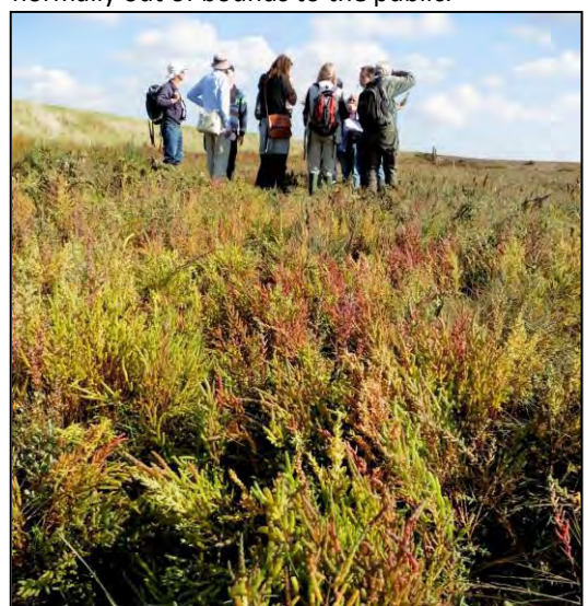
Glassworts galore.

With a brilliant clear blue sky and temperatures of 22°C we couldn't have wished for a better October day for our last meeting of 2014, led by Lliam Rooney and Sue Buckingham. The purpose was to concentrate on saltmarsh plants and in particular Salicornia , glasswort species, in Sharfleet, Cockleshell and Wellmarsh Creeks in the south of the Elmley National Nature Reserve. This 3000 acre reserve is owned and managed by a farming family who graze some 700 cattle on its vast freshwater marshes for the benefit of birds, hares and wildlife in general. Up until May 2013 the RSPB were looking after part of the reserve but management is currently back in the hands of the owners who very kindly gave us permission to botanise in areas which are normally out of bounds to the public.