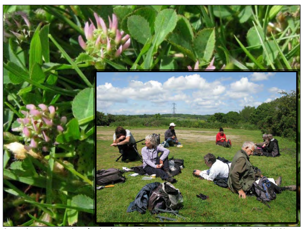
Lunch taken on Trifolium glomeratum.

Some other interesting plants for the day were Silene x hampeana , the hybrid between Red and White Campion with both parents, Trachystemon orientalis (Abraham-Isaac-Jacob) established with other dumped garden waste and Senecio sylvatica (Heath Groundsel). Frog, toad and grass snake were seen and records promised to KRAG (Kent Reptile and Amphibian Group). Apart from a heavy shower towards the end of the afternoon, the weather was much kinder than expected.