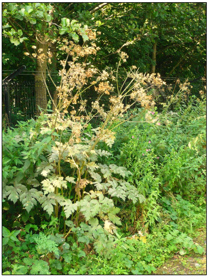
Heracleum sphondylium x H. mantegazzianum (Hogweed x Giant Hogweed), Belfast. See page 65.