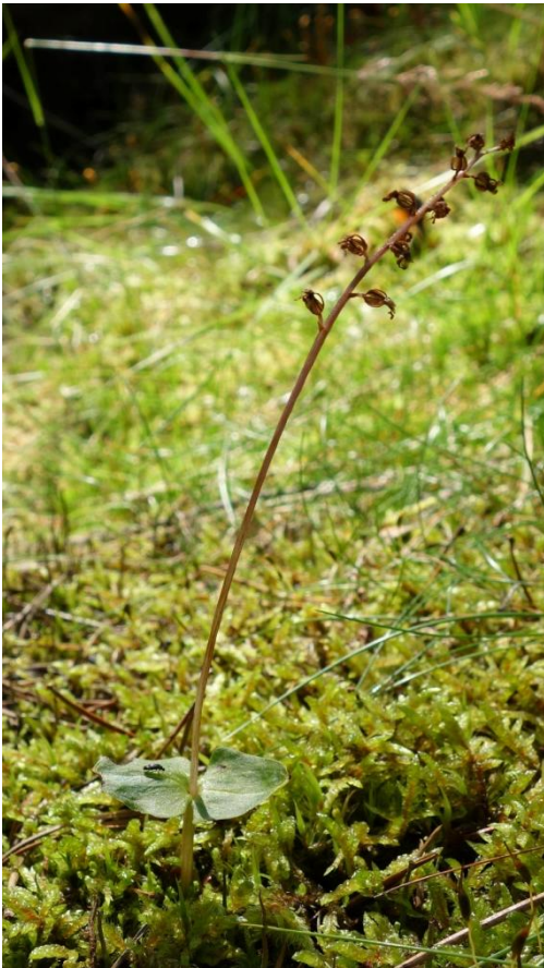
Lesser Twayblade Listera cordata , Glen Muick, August 2015.