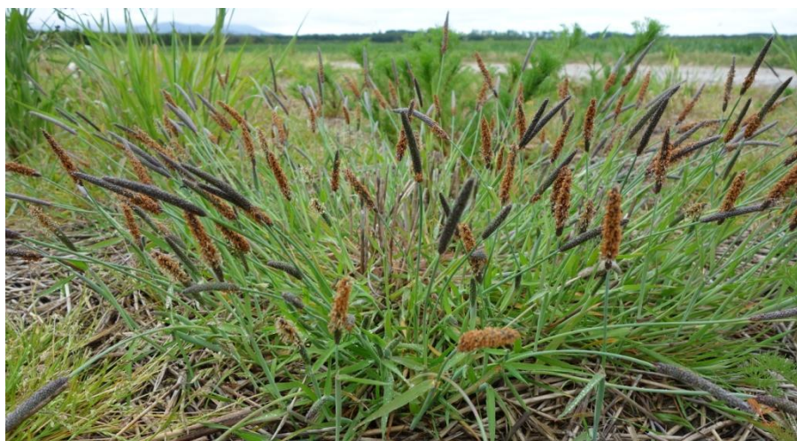
Marsh Foxtail Alopecurus geniculatus , Sauchen, June 2015

Within a 1x1km square, try and record at points in the vicinity of six-figure grid refs in varying habitats, to help make up a composite list for the square whilst also recording fairly close to known points. If you find interesting species or habitats, please use a GPS to record these accurately and note any details.