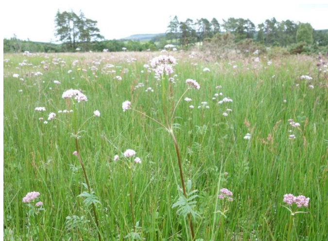
Fen with much Valerian Valeriana officinalis near Millbank, July 2015

As before, the priority is to gain records for the next UK plant atlas 2020 , covering the period 2000-2019. I would still very much appreciate your help in this as there are still many areas which require exploration. The map overleaf shows where we are with coverage to the end of 2015. There has been some good recent recording progress, helped by the BSBI field meeting held near Ballater last August, but the remaining gaps are clear and your help in filling them is needed! Please get in touch and plan some nice days out this year!