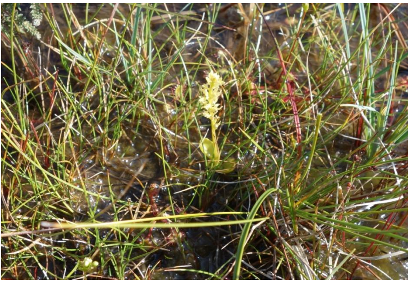
Bog Orchid Hammarbya paludosa , Glen Muick, August 2015. A very nice find on the BSBI field meeting!