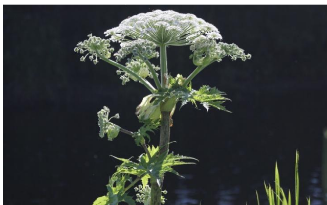
2015 saw a renewed initiative by Aberdeenshire Council to improve knowledge of the status of alien invasive species such as Giant Hogweed Heracleum mantegazzianum , here by the River Don at Inverurie, July 2015. All records are welcome!