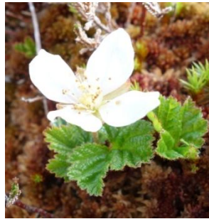
Cloudberry Rubus chamaemorus