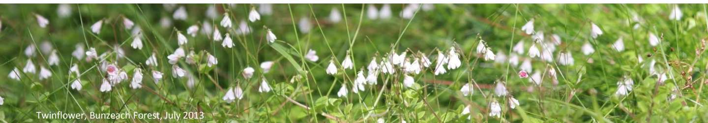
Twinflower, Bunzeach Forest, July 2013

I will take stock of this at the end of the year to see which are the priorities for targeting in the remaining three years of the atlas. My recommendations for targeting recording this year are given overleaf.