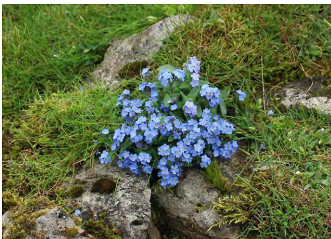
Prolific flowering of Myosotis alpestris on Little Fell, Westmoreland.

Myosotis alpestris is closely related to M. sylvatica from which it can be separated by having fruiting pedicels as long