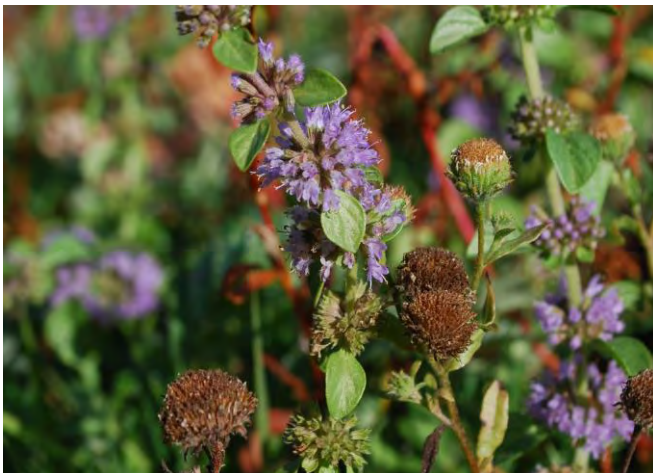
Mentha pulegium at Cadnam Common in the New Forest, arising between the seed heads of Pulicaria vulgaris .

The elliptic-ovate yellow-green opposite leaves are strongly channeled, have very small (1-4) teeth (-subentire) per side (Poland & Clement 2009), and are dotted with glands containing a strongly mint-scented essential oil (Kay & John 1995). The stems (8-20 cm) root at the nodes, are weakly arching or prostrate and have fine, downy hairs.