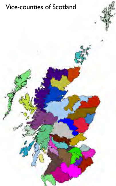
Vice-counties of Scotland