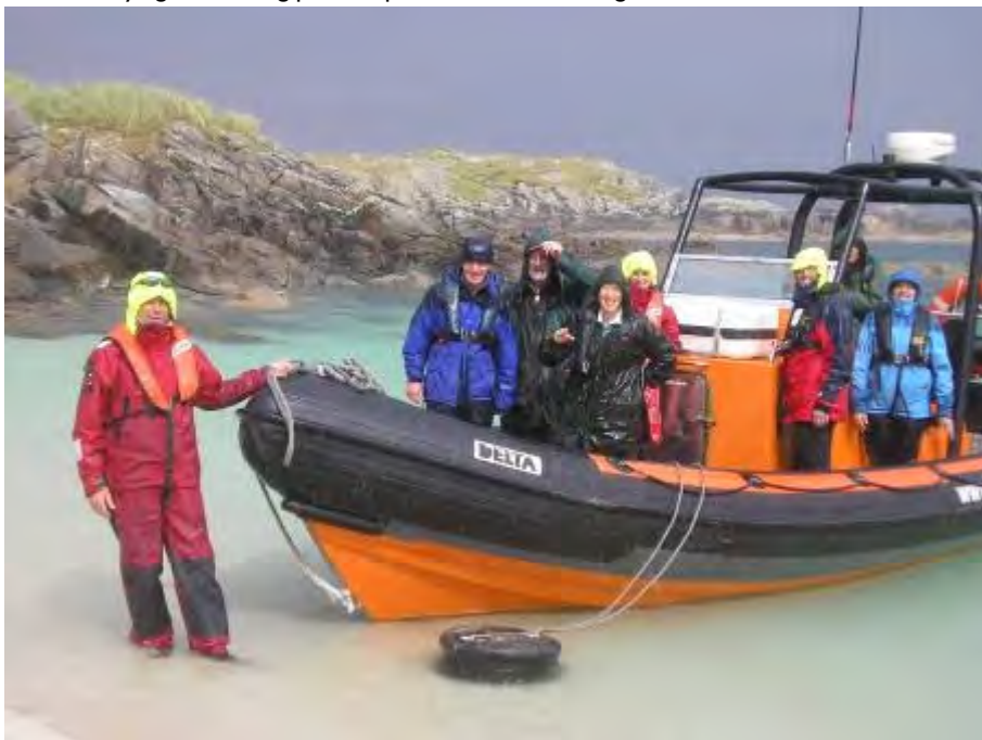
BSBI surveying team being picked up from Little Berneraigh, Lewis, 2008

During 2007 a further two RPRs were completed and published on the BSBI website – one for vc110, Outer Hebrides, and one for vc106, Easter Ross, bringing the total number of published RPRs up to four. A further ten are in various draft stages.